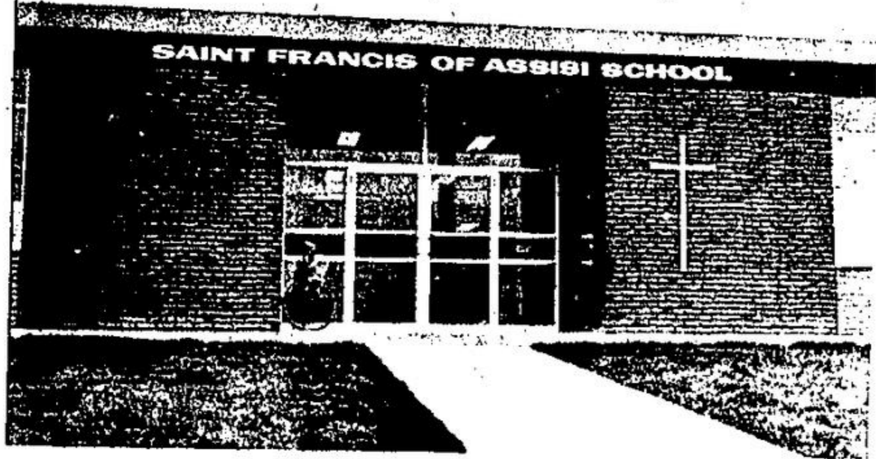
St. Francis of Assisi school on Duncan Drive.

The recently completed separate school, at Sinclair and Duncan, St. Francis of Assisi School, opened its doors Tuesday morning to over 200 students, relieving the pressure at Holy Cross School, where most of the portables have been removed. The new school houses kindergarten to Grade 6, in its two wing open concept building. Each area is carpeted to reduce noise level, and individual lockers line the halls. A gymnasium, resource centre, and seminar room, plus the separate kindergarten, complete the junior school. While grades 7 and 8, are available only at Holy Cross School, the other grades were filled by transfers of students living in the east end of town, and many new registrations. The nine member staff includes principal J. Huston, Mrs. D. Clendening, Mrs. H. Woods, Miss S. Landry, Miss M. Kelly, Miss M. Giashi, Miss C. Boisa, Mrs. M. Boag, and Mr. M. Goett.