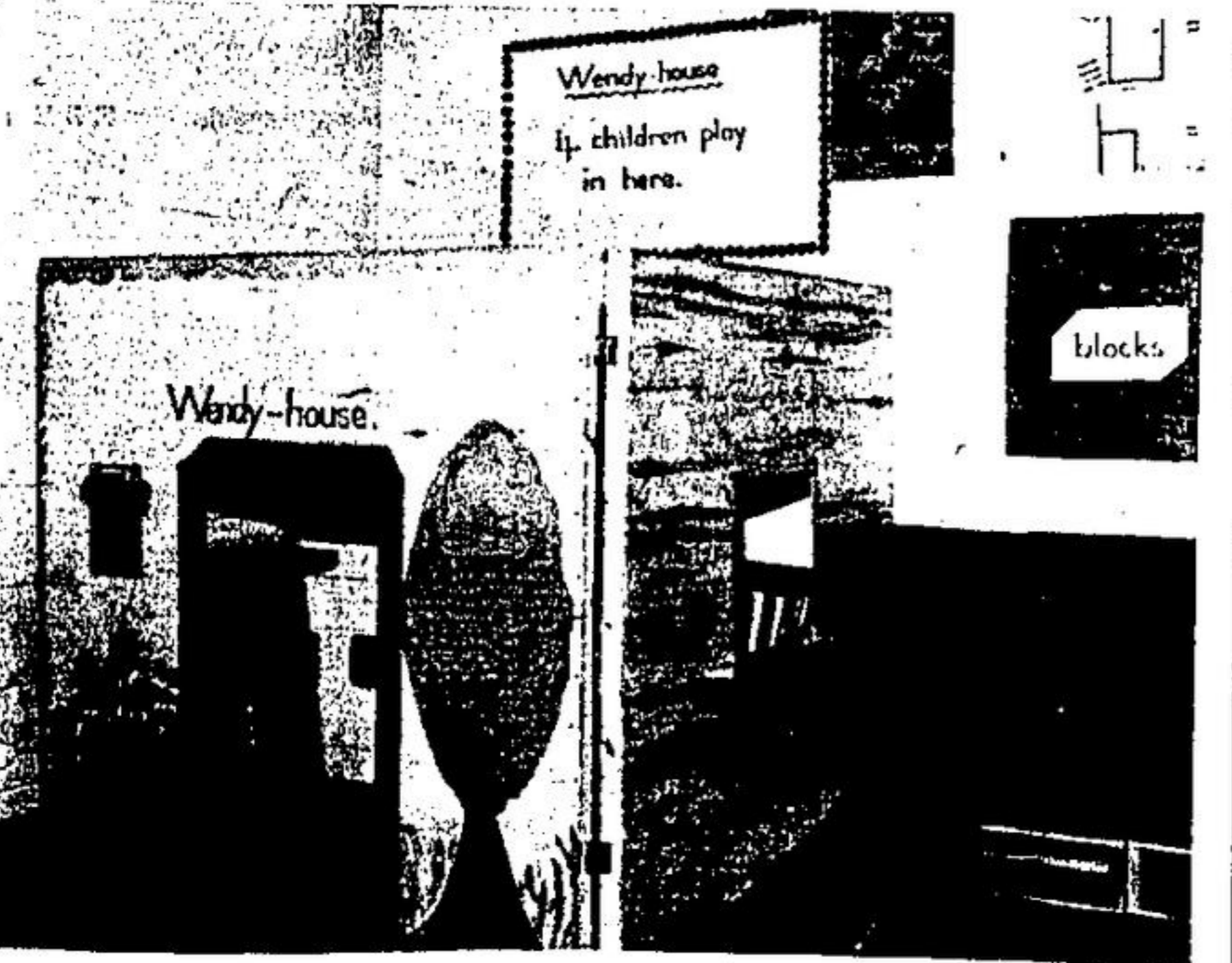
Kindergarten children have a playhouse.