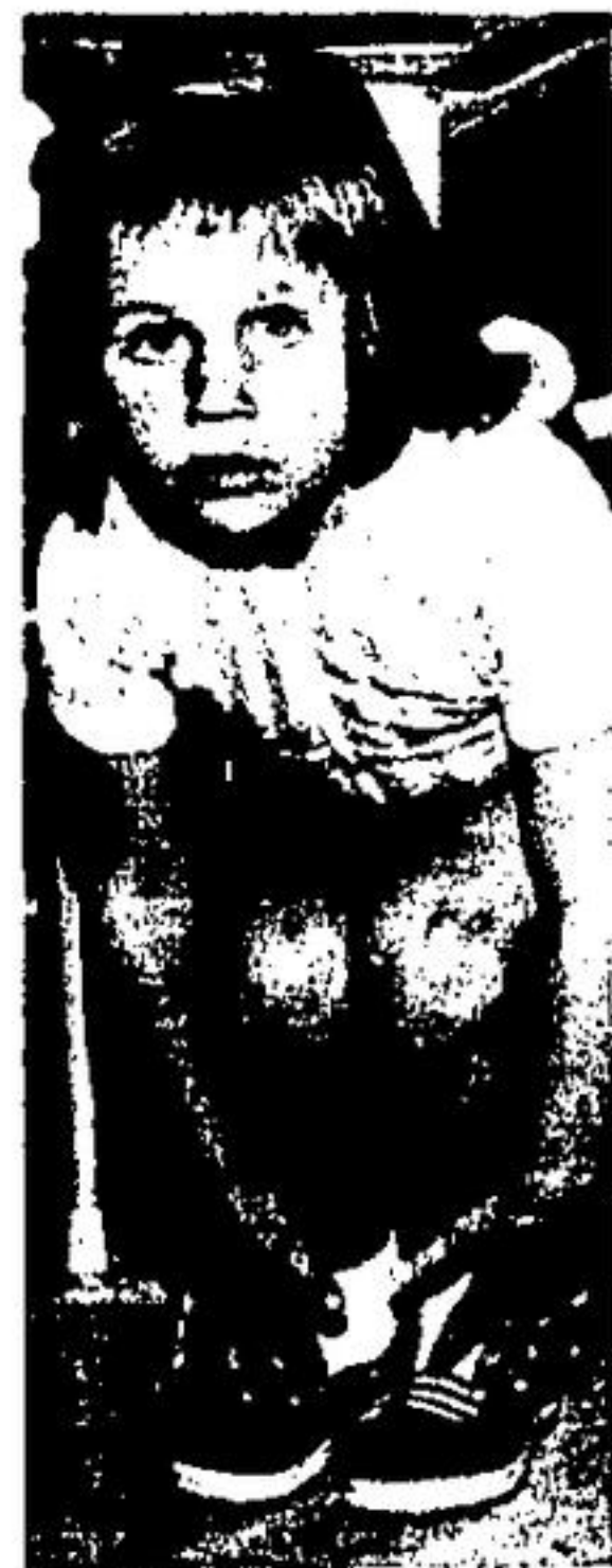
Exercises are part of the morning program.

The vacation Bible School held in the Christian School on the 7th line last week drew 132 children to its morning workshops. The vacation school, sponsored by the Evangelical Committee of the Christian Reformed Church, offered a wide range of programmes to children from four to 12. The students, divided into six groups roughly by ages, cut, paint, decorate, sew, play games, and have light refreshments. Each morning started with group singing, and a brief devotional period.