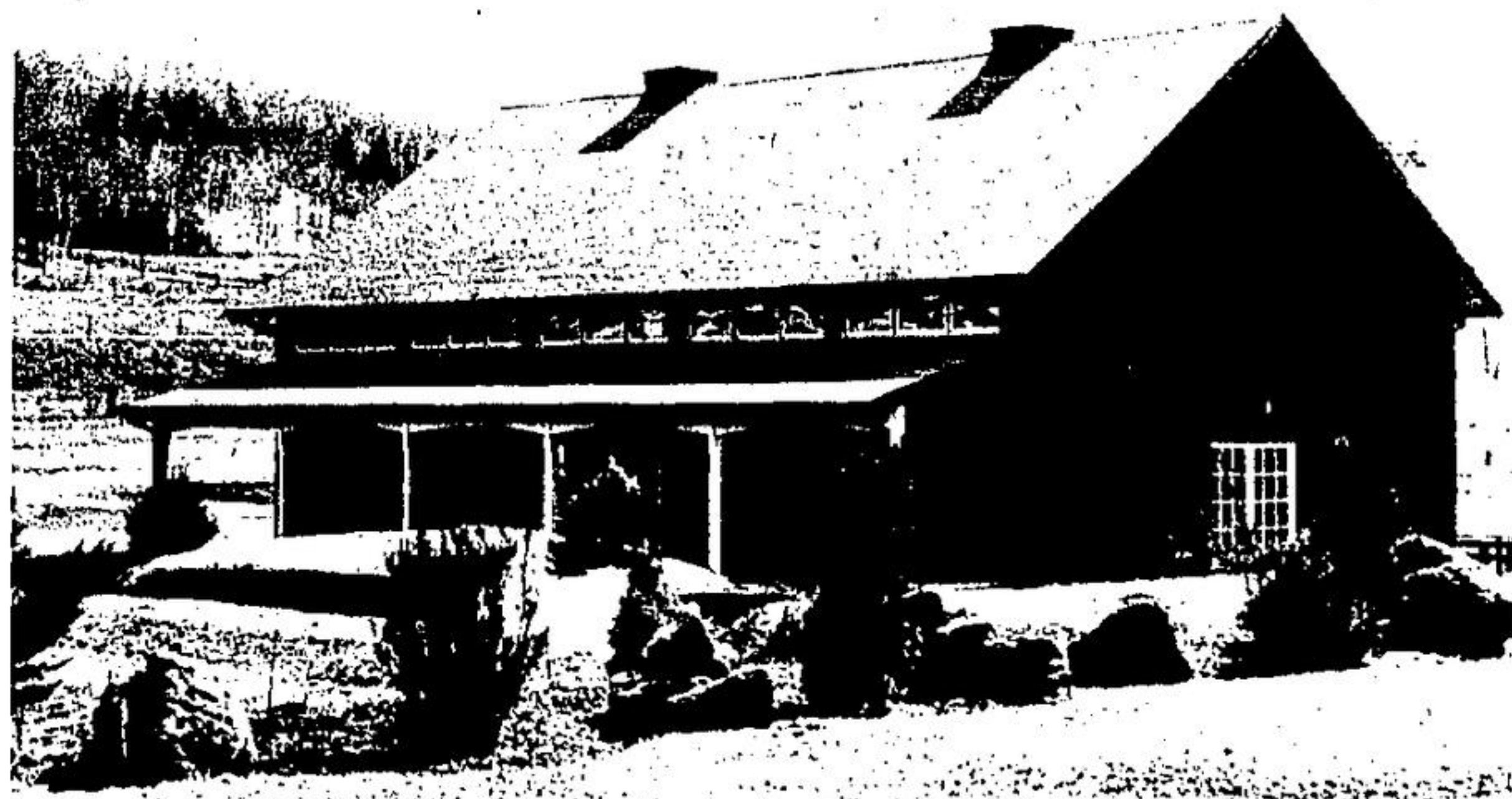
Coach house at Halton County's Museum at Kelso

by Judith Goebelle The Halton County Museum, at Kelso Park, R.R. 3 Milton, will be the site of good family entertainment this weekend when the "Friends of the Museum" present their second annual summer festival.