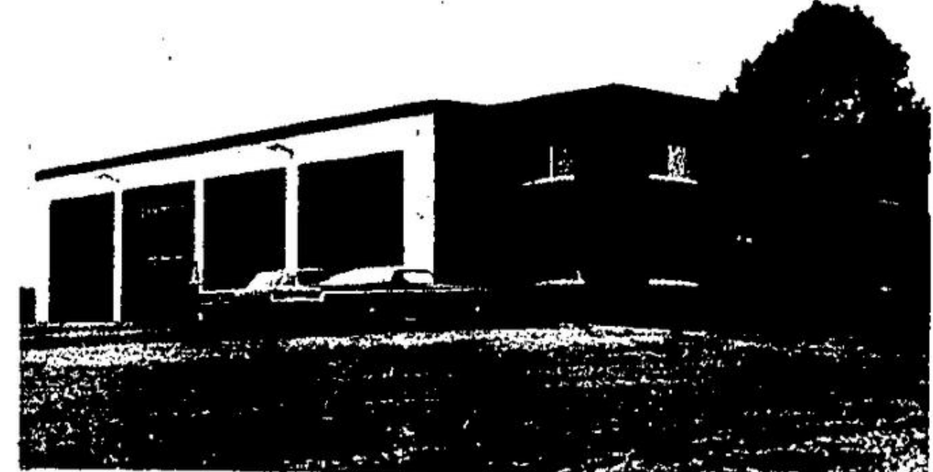
Esqueping Township's new works garage officially opened this month.