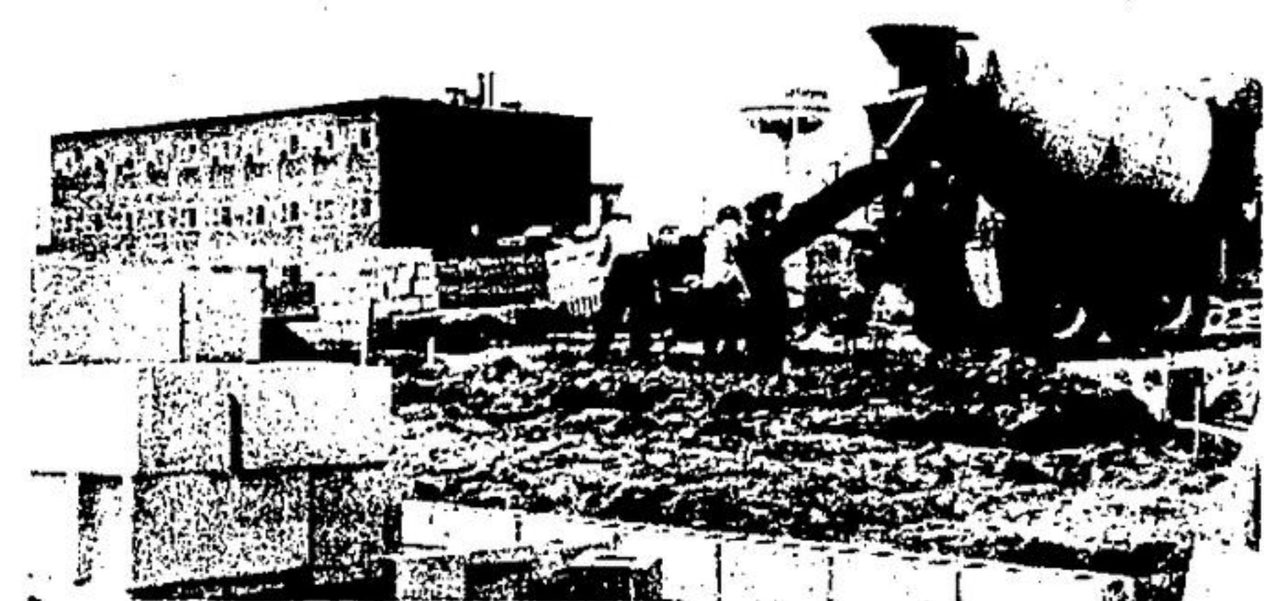
Construction on Canadian Tire's new store on Mountainview creeps above ground level.