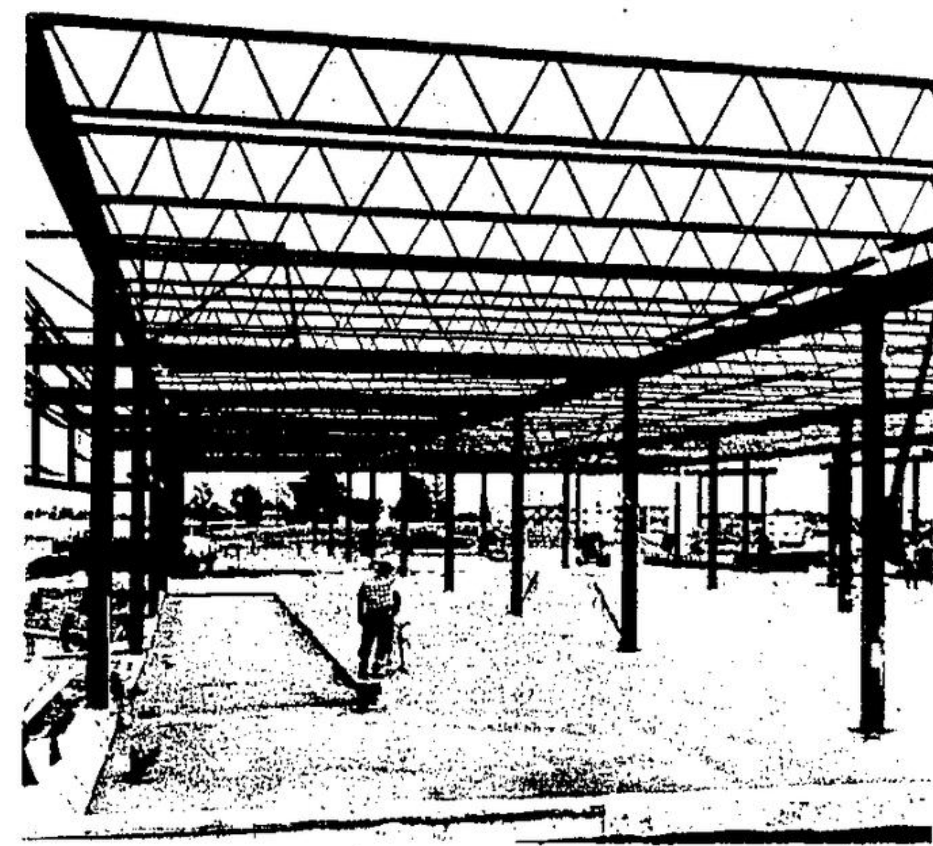
A steel skeleton outlines the shape of Zellers Department Store going up in the Georgetown Market.

the more for your money car $1975. North End B.P. DATSUN SALES & SERVICE 235 Base Line Road Milton: 878-2471 Open Weekdays 7 a.m. to 9 p.m. Sundays: 9 a.m. to 7 p.m.