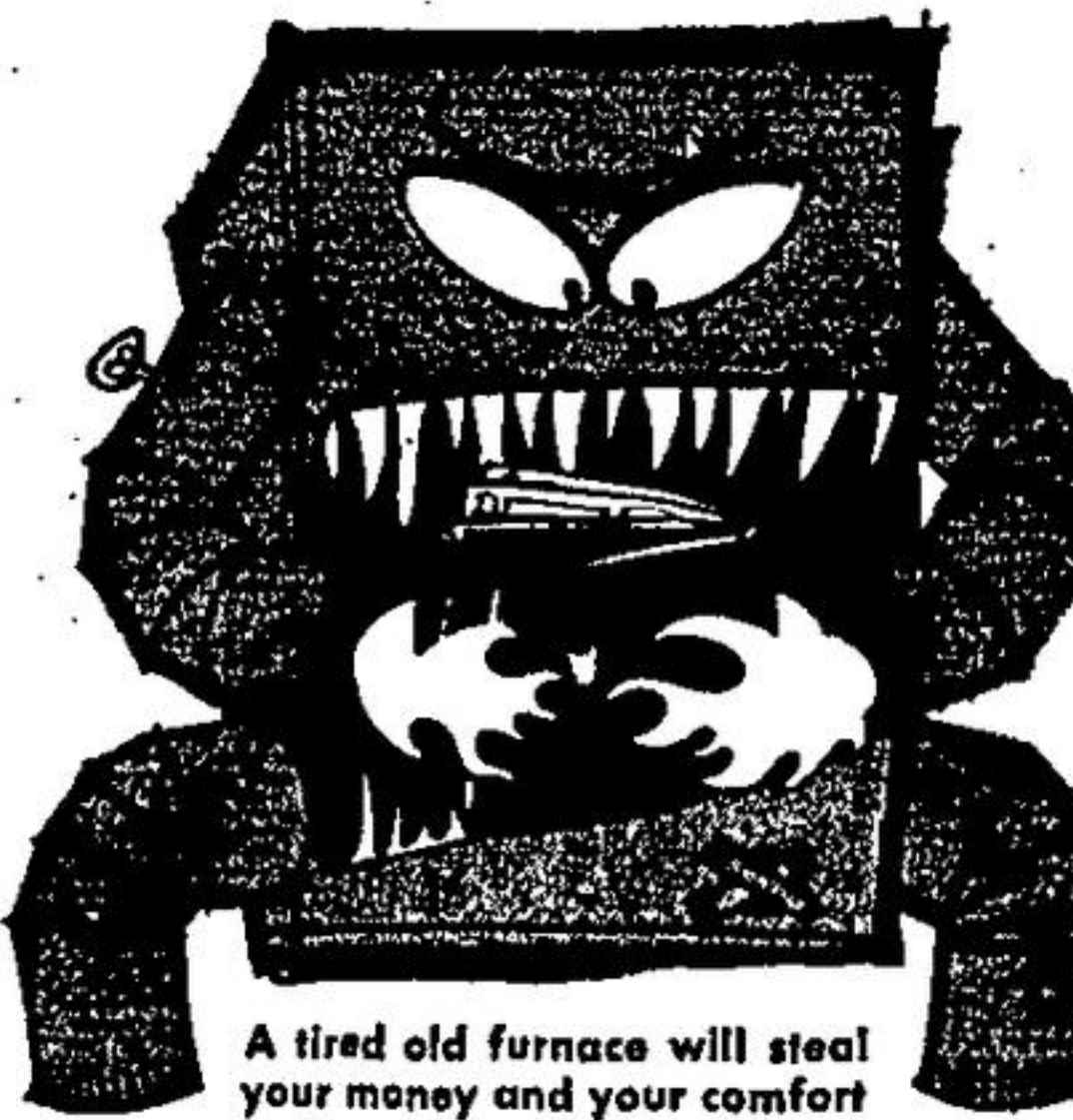
A tired old furnace will steal your money and your comfort too!

Install a new Furnace now! Pay nothing till October 1st