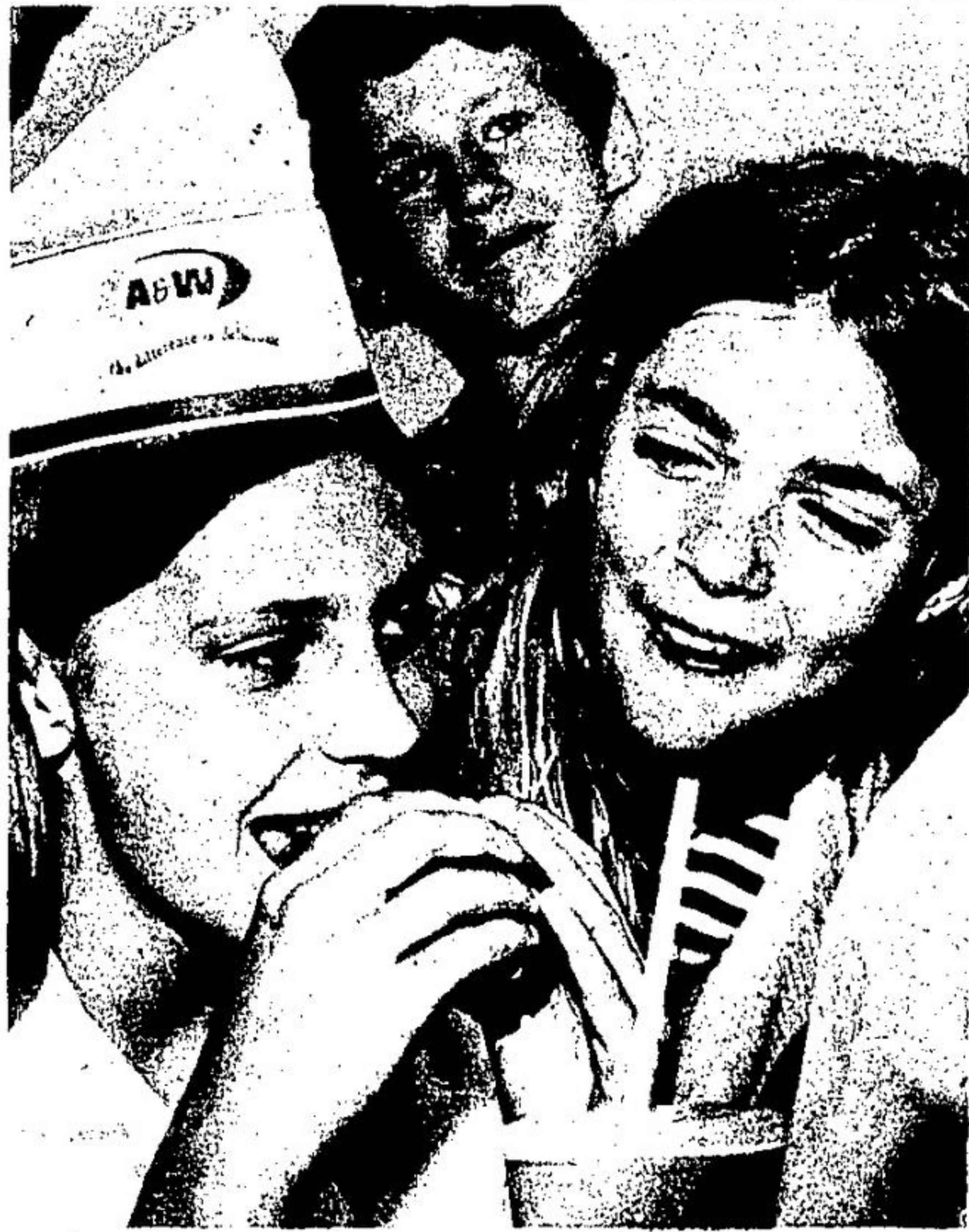
Even gals got in on the mamaburger munching at the A & W's consuming contest June 7. The compulsion was part of the drive-in's first birthday celebration. Contestants were kept supplied with loaded mamaburgers and root beer to wash them down.