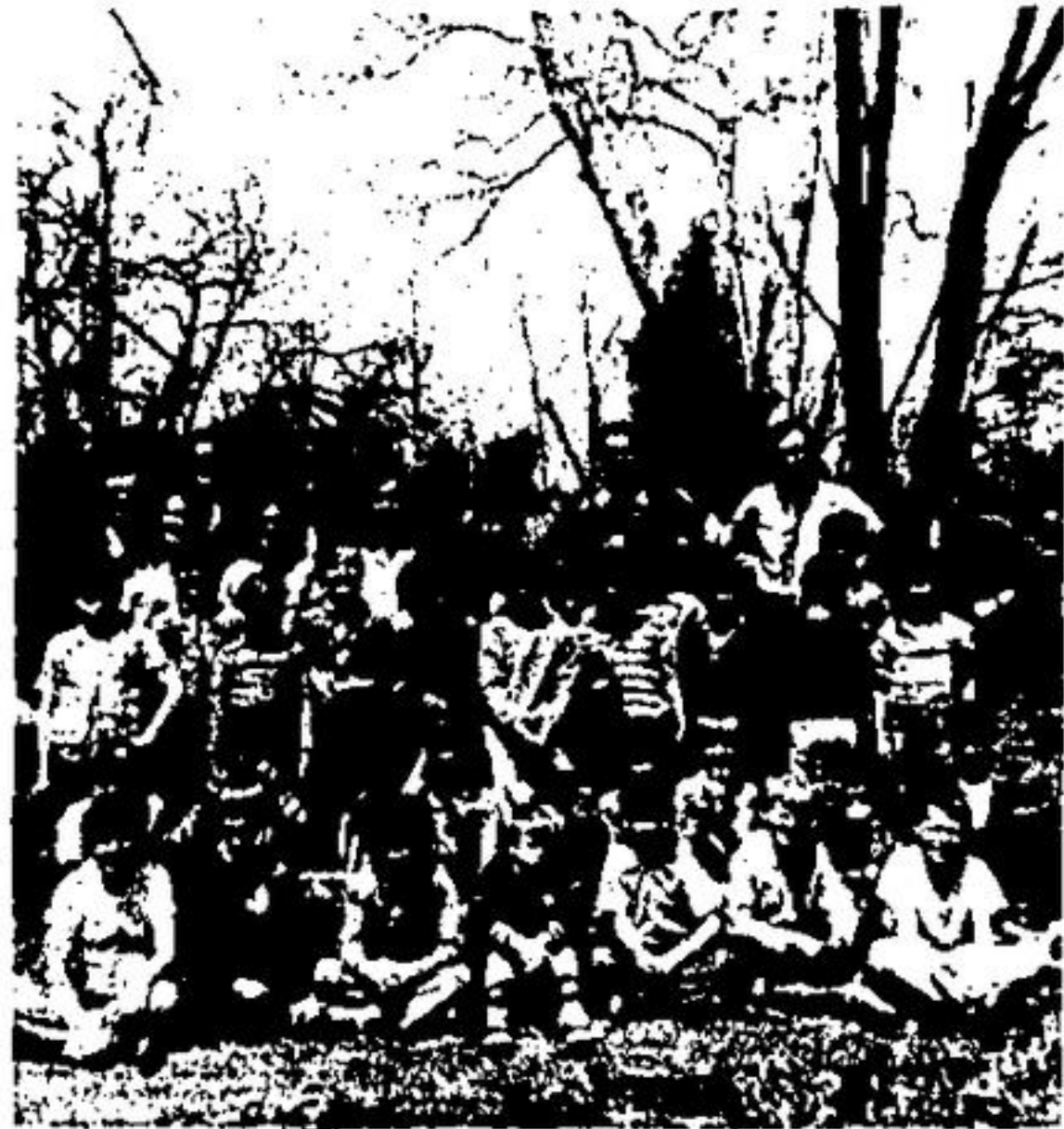
First and second year Georgetown District Cubs and leaders still manage smiles after climbing around the rocky Niagara Escarpment during a May 9 hike.