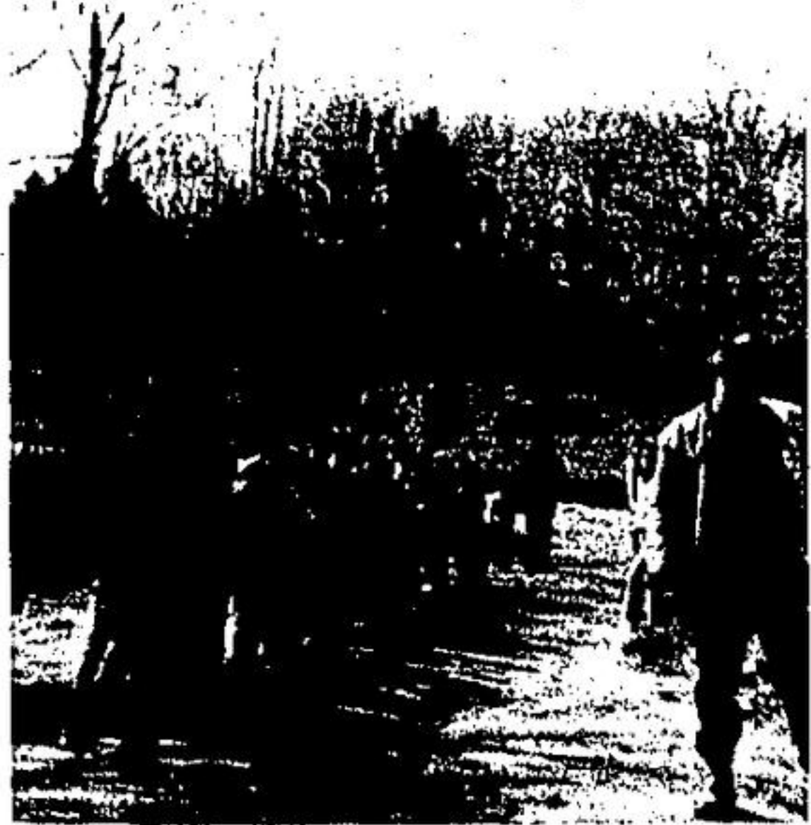
Fresh and eager are these 33 Cubs at the start of the Rattlesnake Point hike. First and second year Cubs took part in the hike highlighted by a good look at seven buffalo in the conservation area.