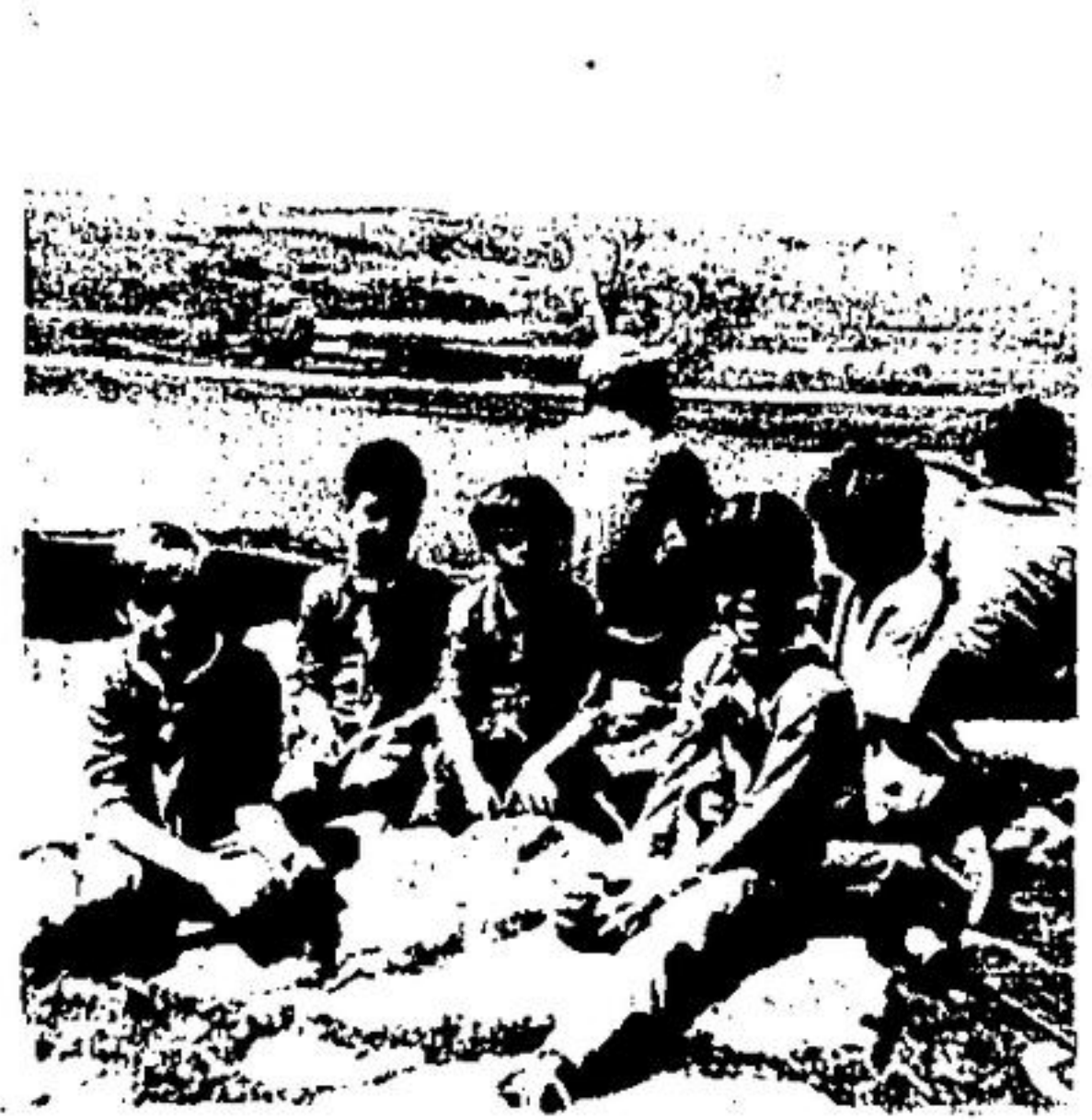
That's Kelso Lake in the distance beyond part of a party of Georgetown District Cubs resting during a May 9 hike in the Rattlesnake Point area.