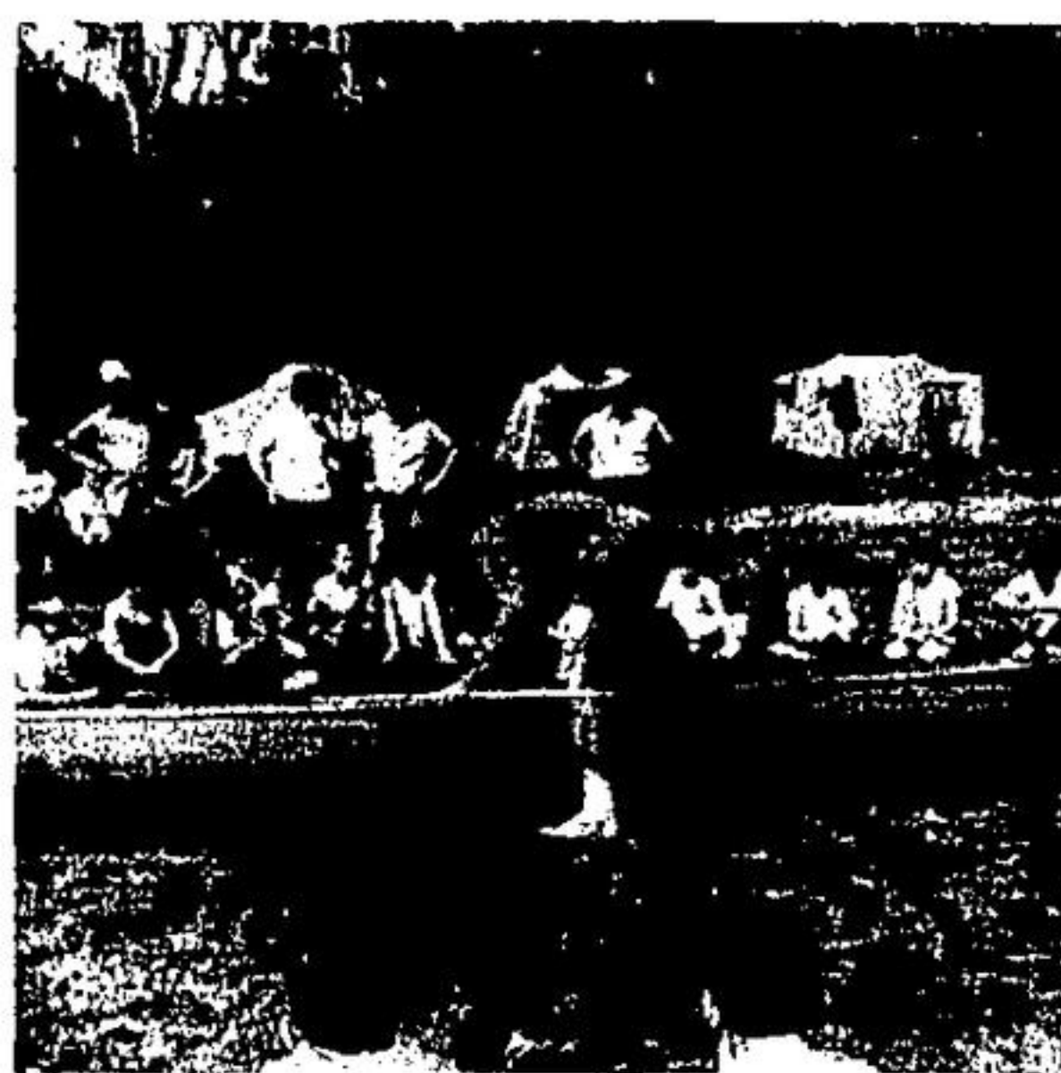
It's one thing to get into a canoe but something else again to stay in it. Scotch Block's Bill Schreiber gives camping cubs a lesson.