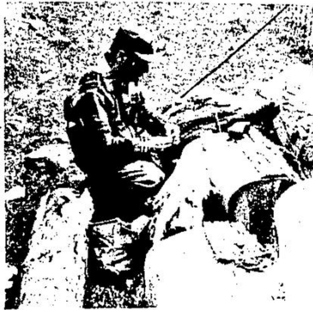
Lorne Fletcher tying roe sacks at the Beaver River