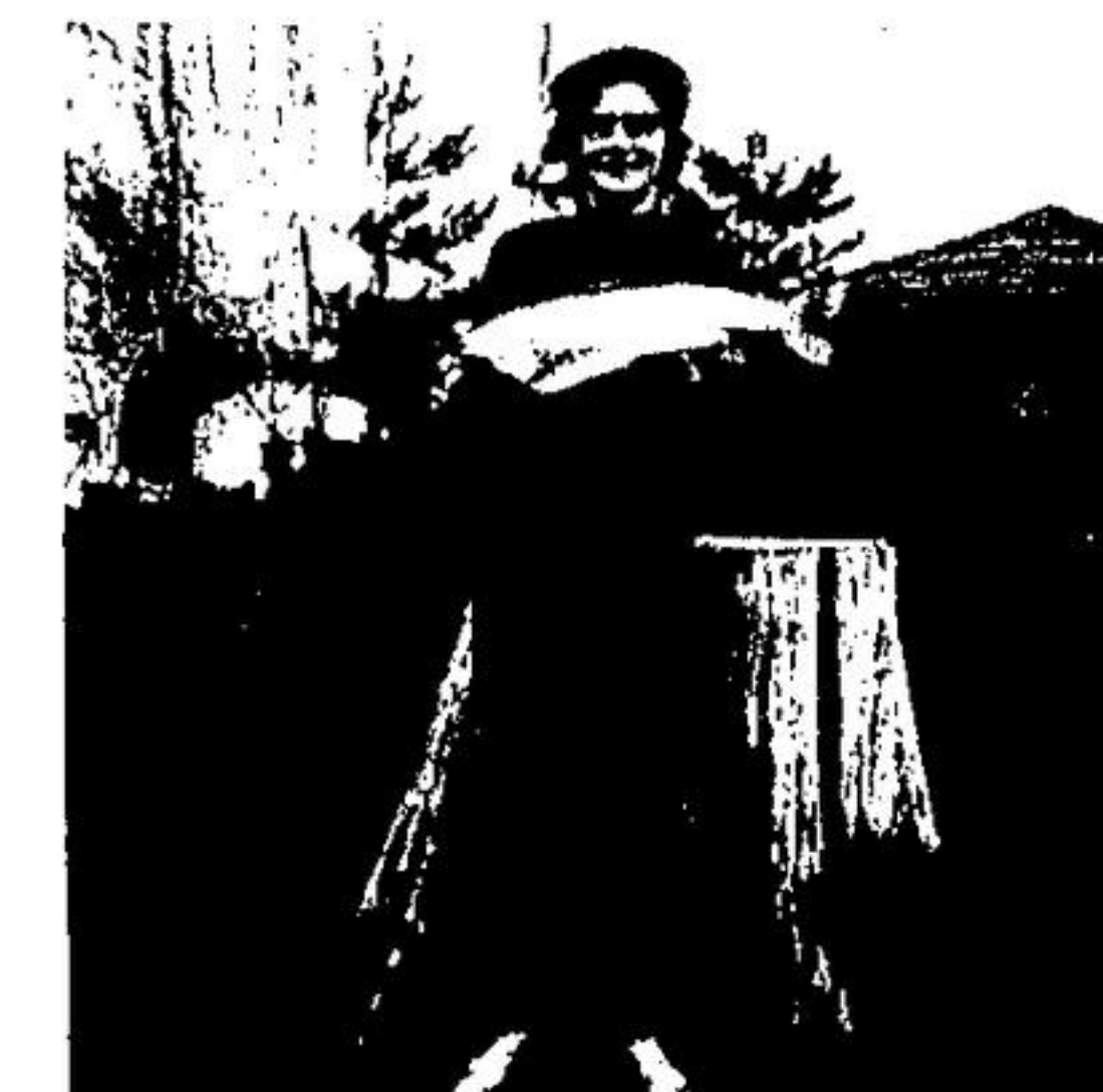
Could be that the bat fly does work