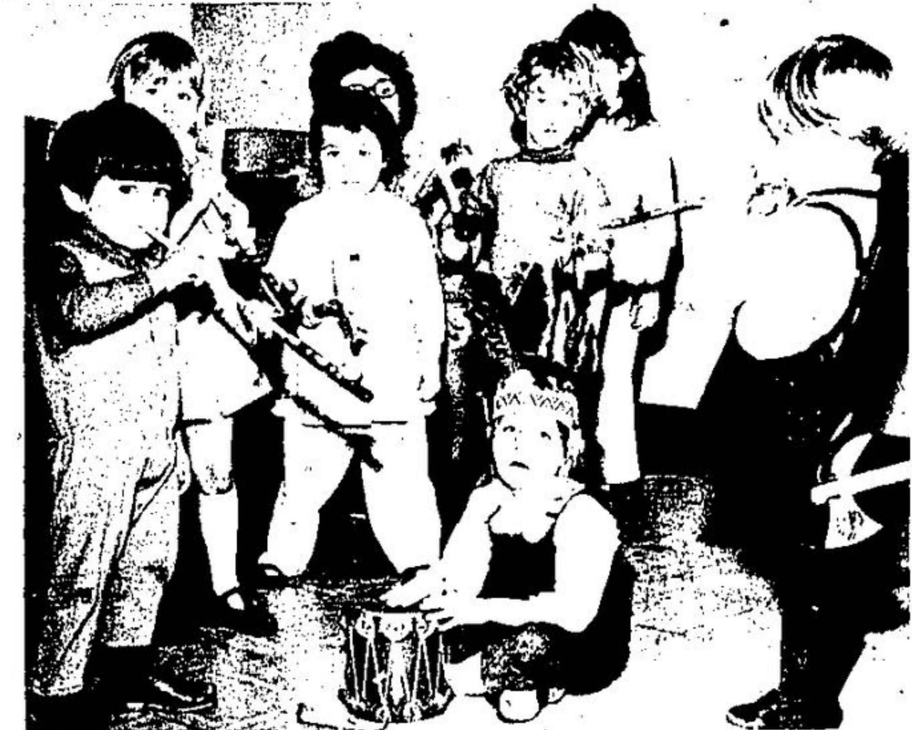
Indians show their friendliness by smoking peace pipes