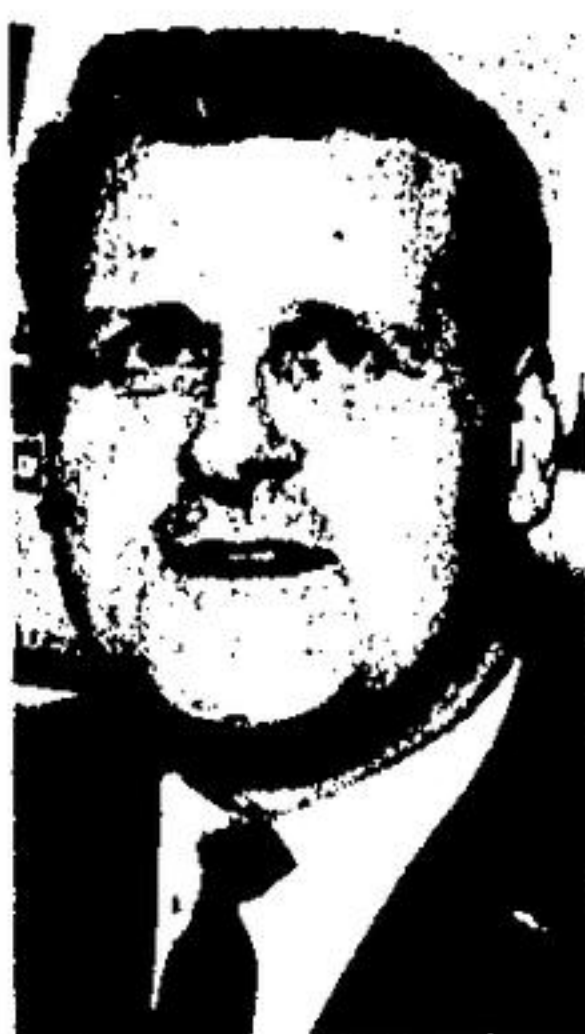
POLICE CHIEF LOWE

Ask for full details at your participating Pontiac dealer's. You can enter GM's MONEY MILES SWEEPSTAKES if you're 16 or over and have a valid driver's licence. You don't have to buy a thing. Entries must be in by May 31, 1971.