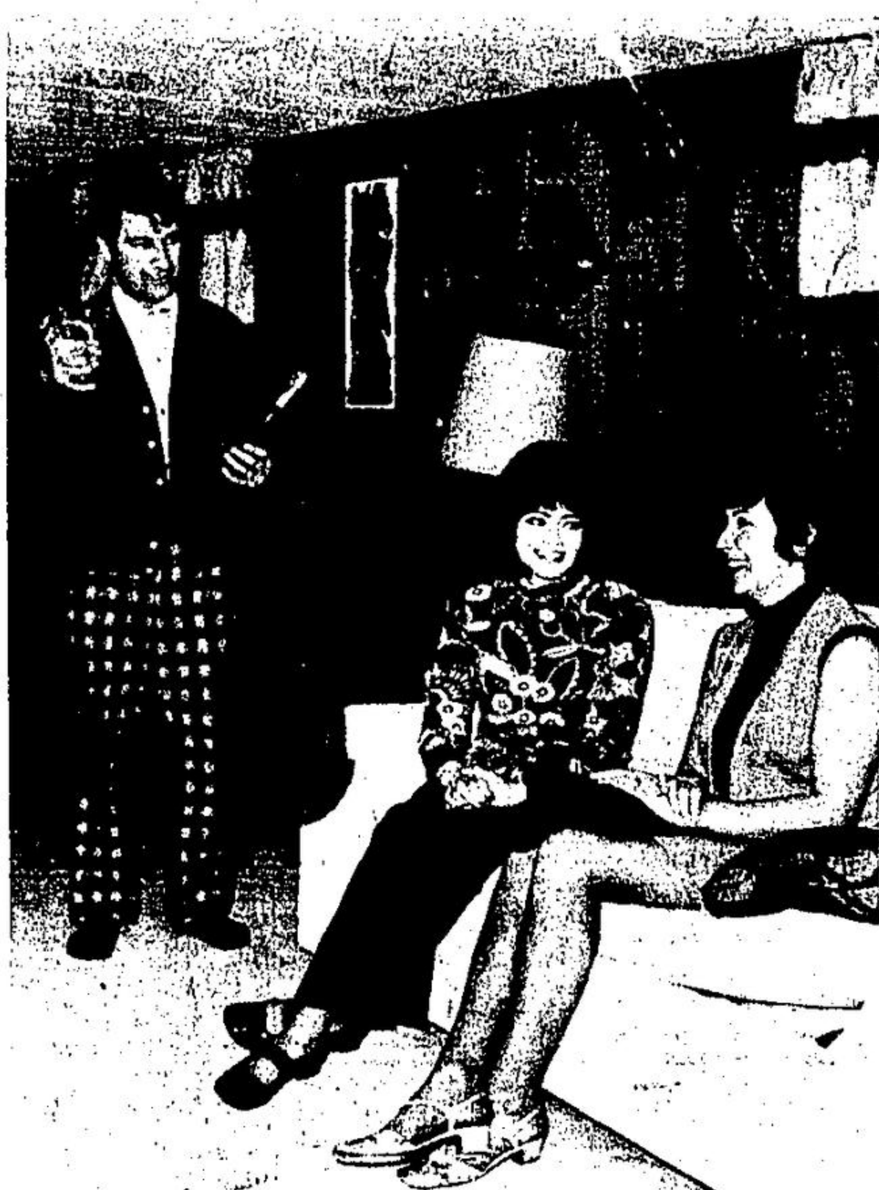
ANYONE FOR BUBBLEY?