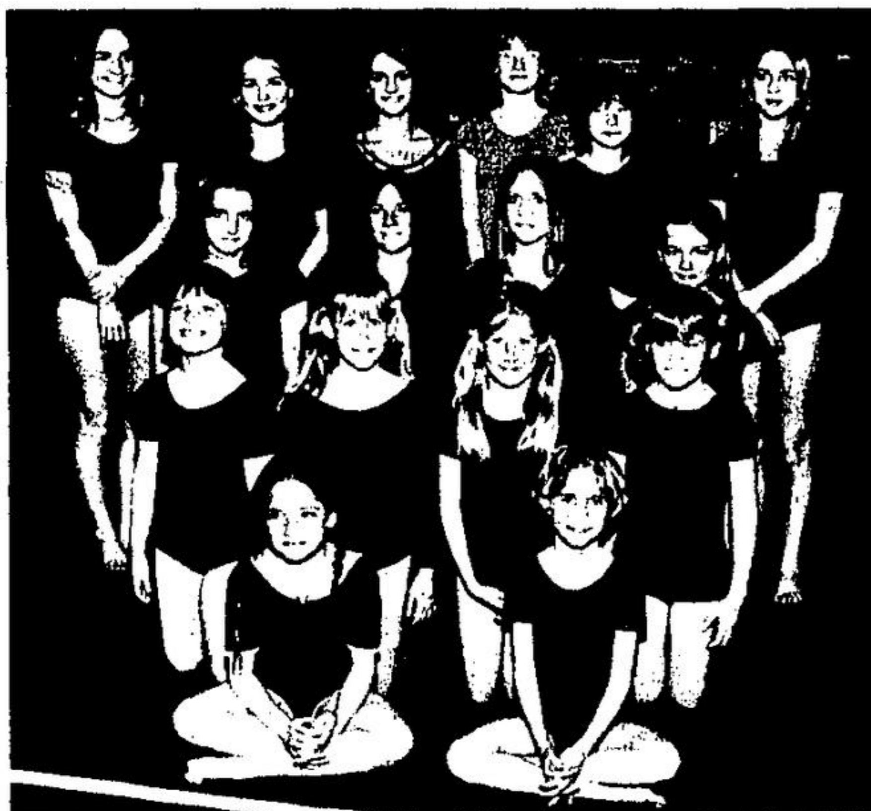
These Georgetown Y gymnastics girls took part in the North York Gymnastic Club Girls Invitational Competition.