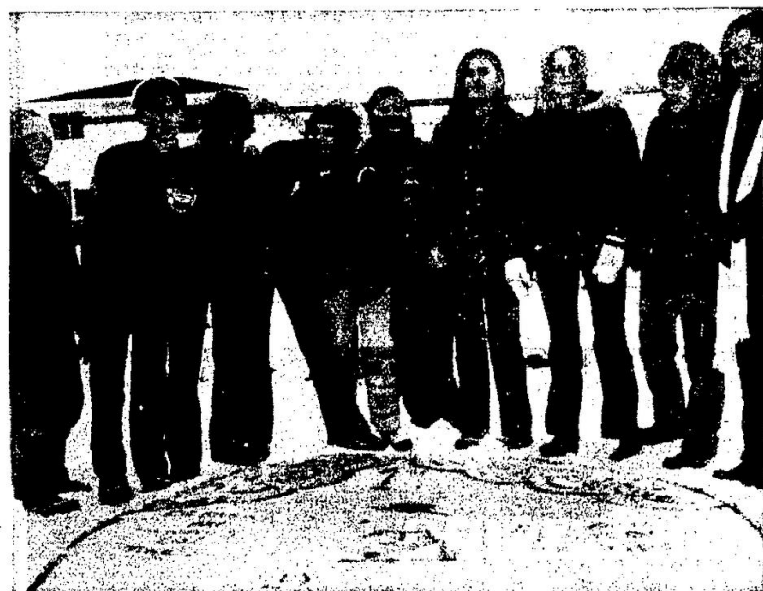
"We're No. 1," say Beavers after winning Centennial School's winter carnival.