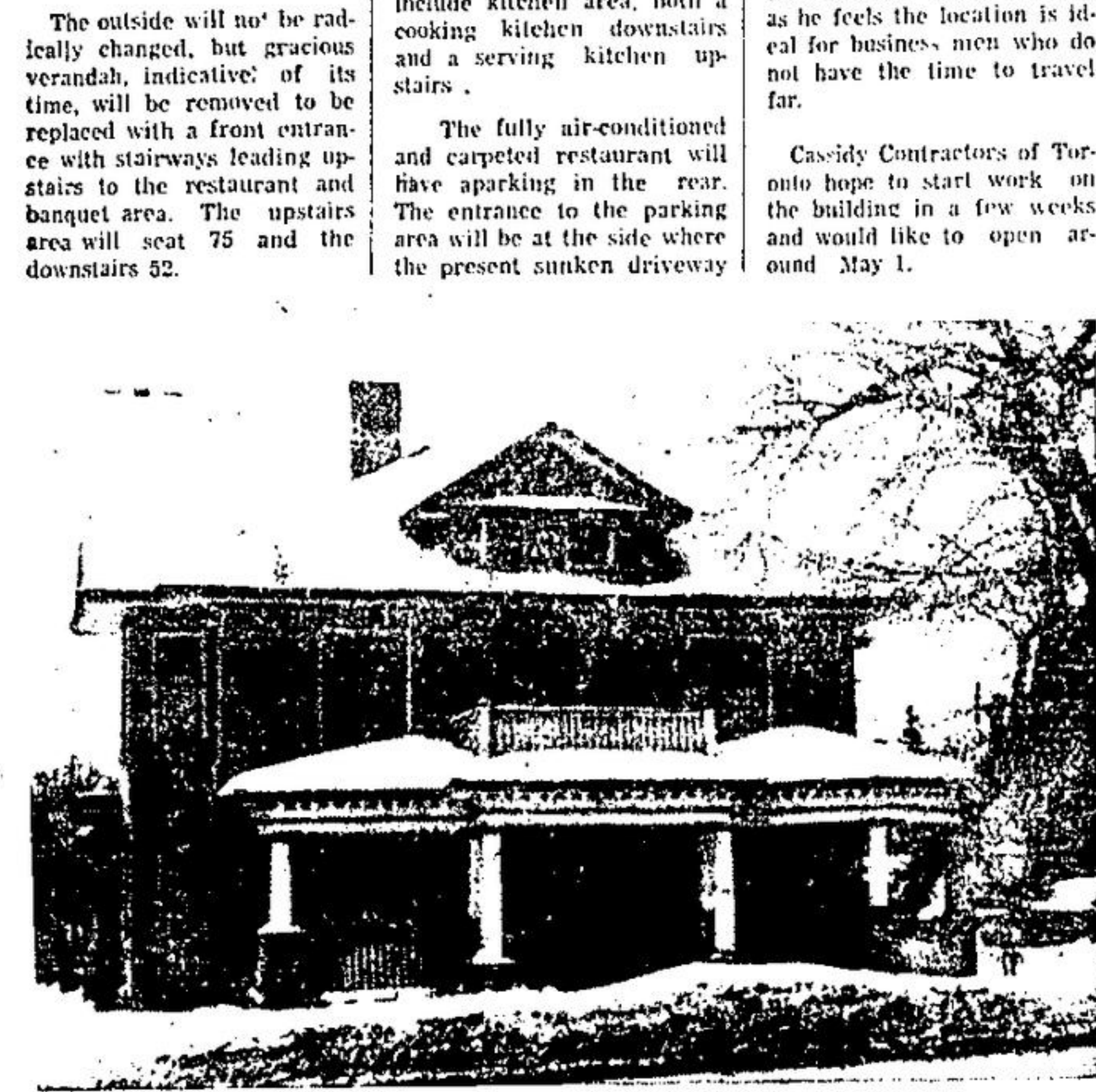
Guelph St. house will become steak house.