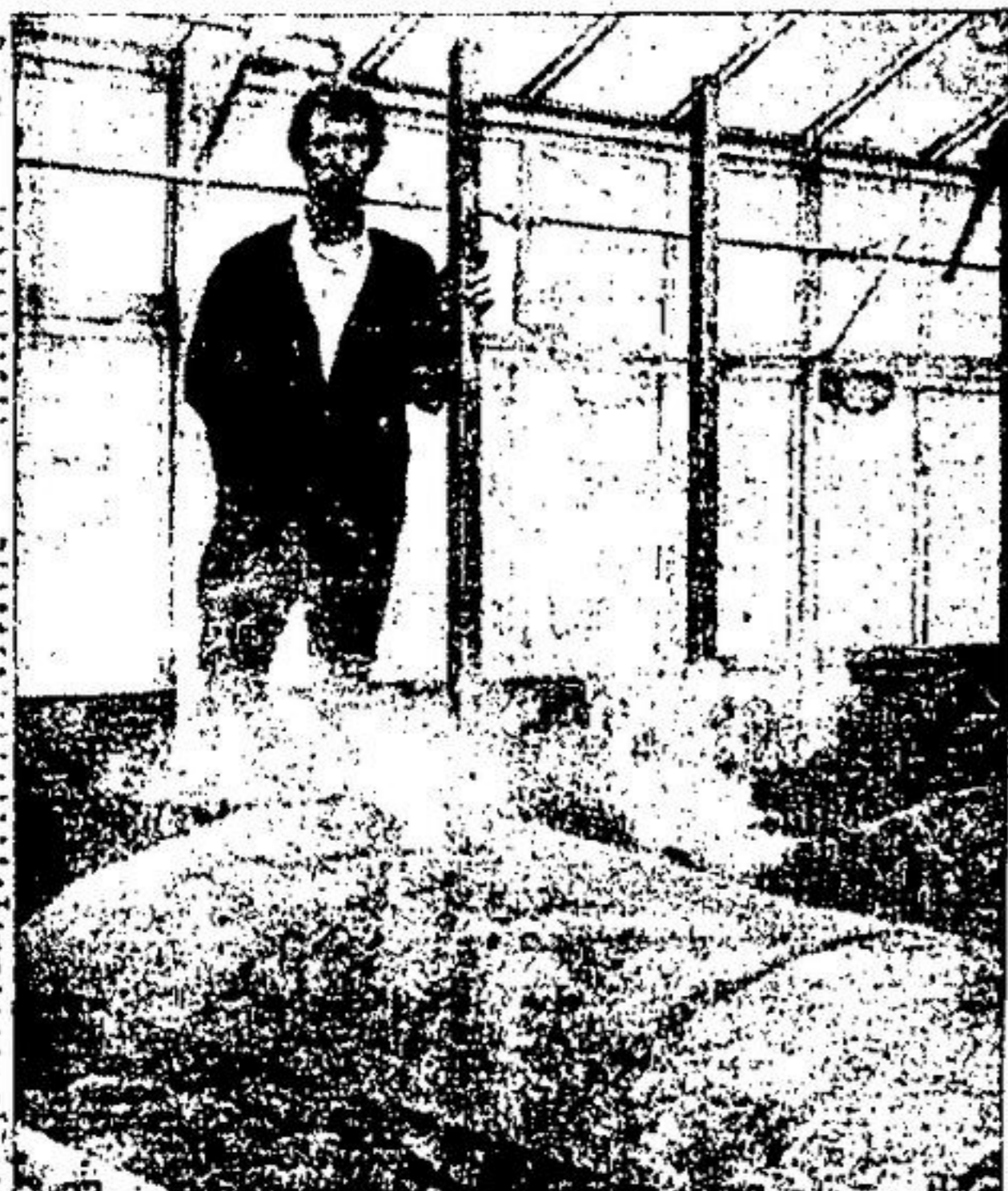
Soil is sterilized with steam prior to new plantings.