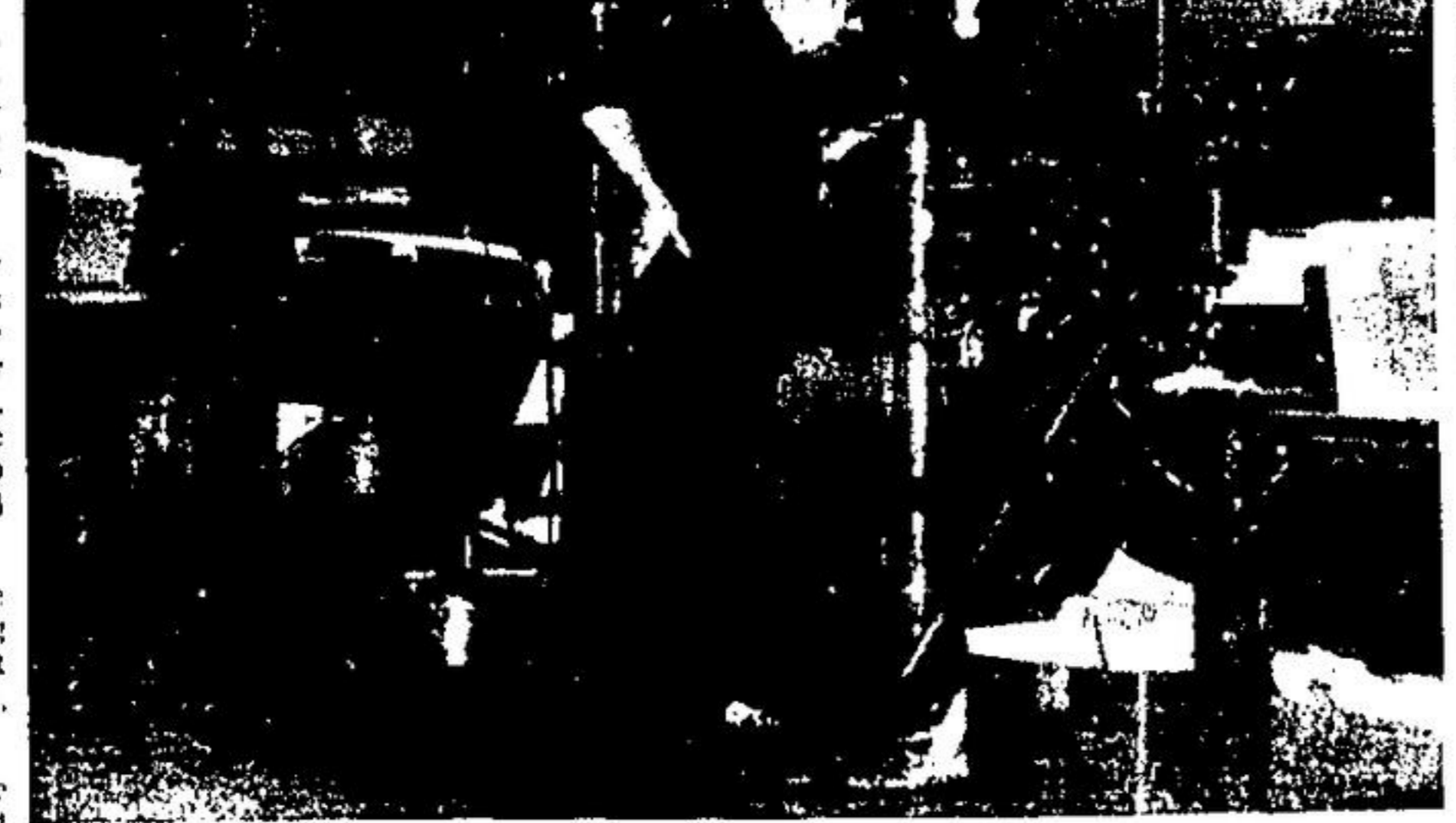
Peter Humeniuk operating file folder.

The present plant, on a ten-acre site on Todd Road, covers 35,000 sq. ft. and is being expanded another 45,000 sq. ft. to a total area of 80,000 sq. ft. The work is being done by McNally Construction.