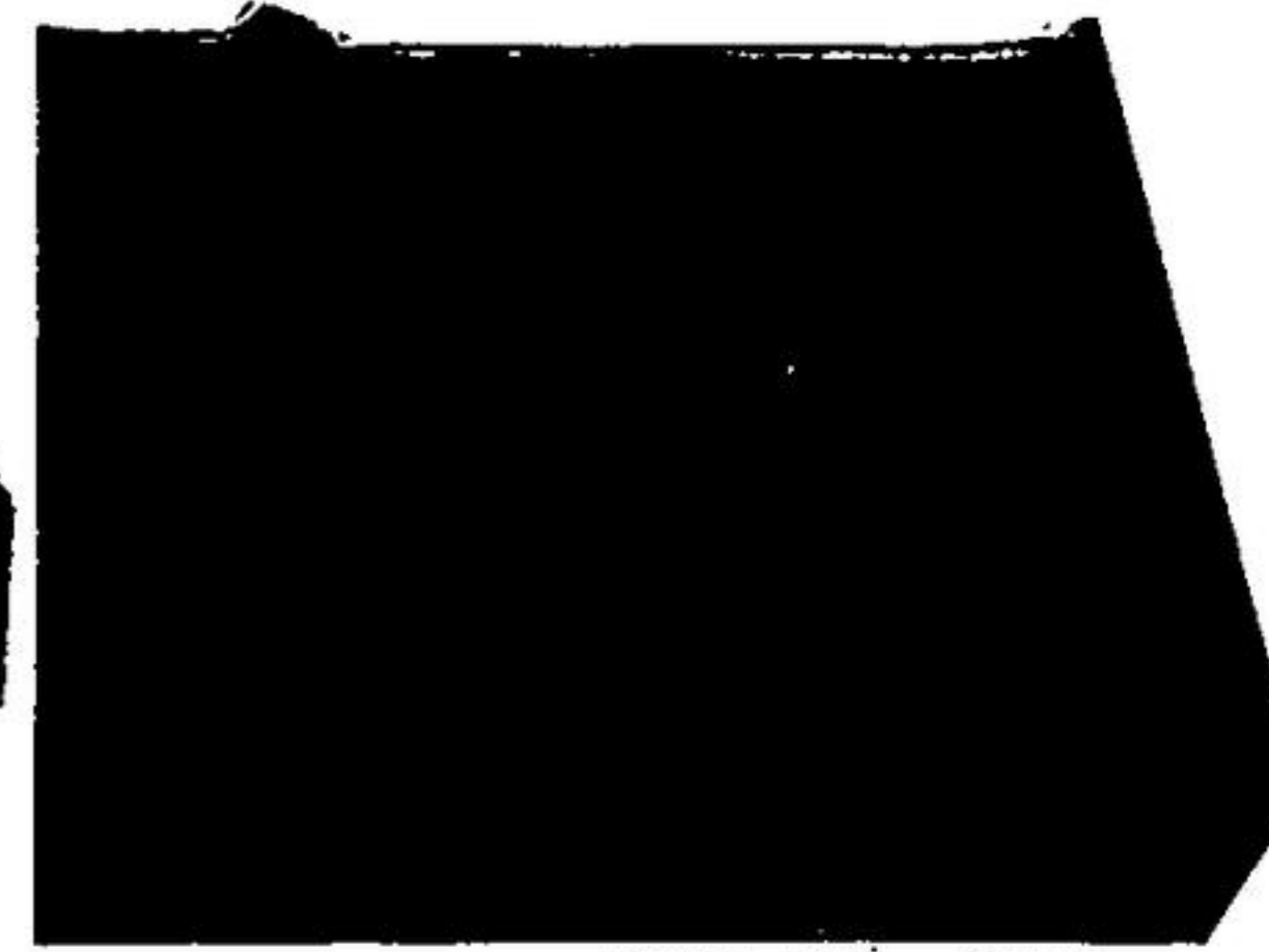
MODEL 1215 — $129.50

If you're about to buy a turntable, naturally you want precision. The problem is that normally you can't expect to have it. Not unless you're prepared to pay a lot for it. But at Dual for the past 50 years, ultimate precision has helped us build our world wide reputation. It isn't something that's only found in our highest priced models: It's built into every turntable we make.