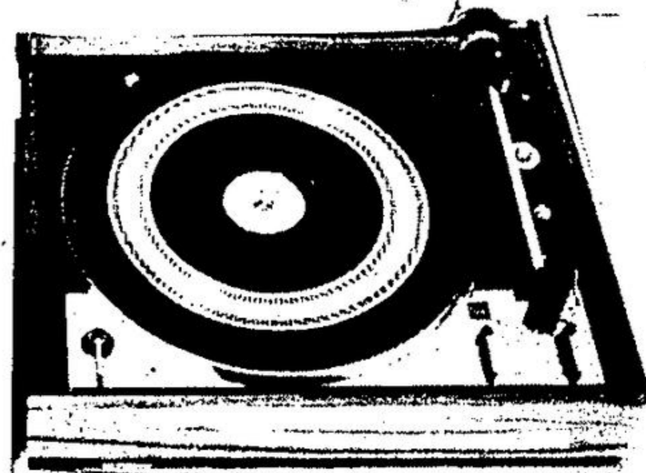
MODEL 1219 — $175