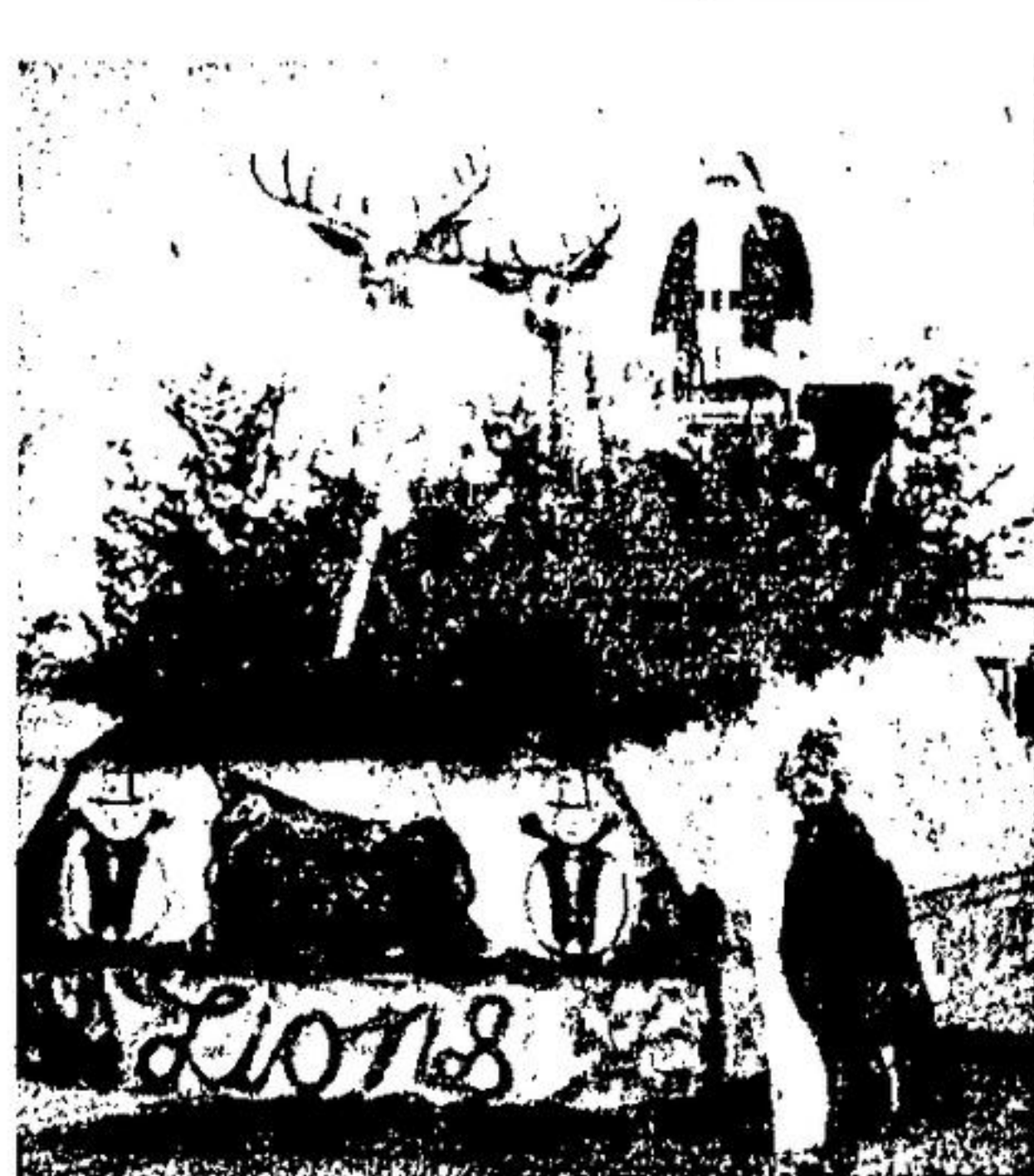
Always last and never least.