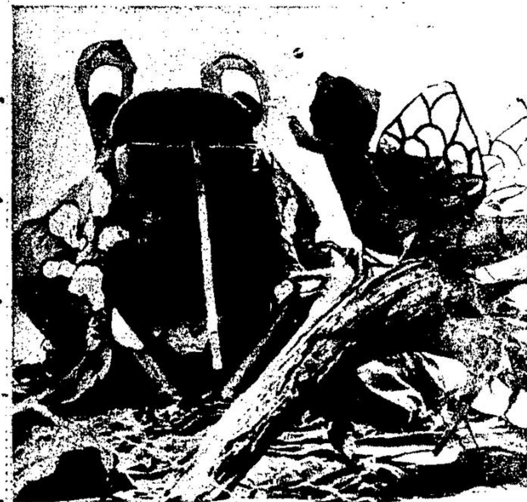
Burnie the Bug, mascot of Georgetown's Fireflies camp club, taunts a fat swamp neighbor from an old stump, just out of reach of the whip-like tongue.