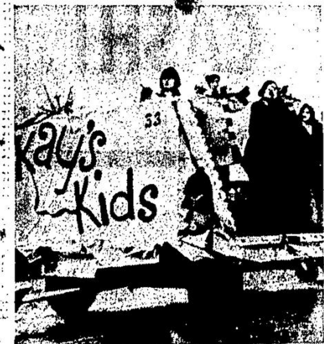
Just a bunch of kids with a will to add their own touch to a swinging procession.