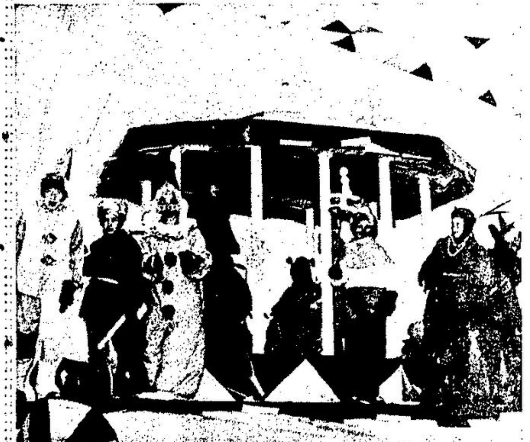
A circus on wheels entertained kids along the parade route thanks to this entry by Penson Farm Equipment. Clowns, Indians, wild animal tamer and juggler were among the colourful group under the big top.