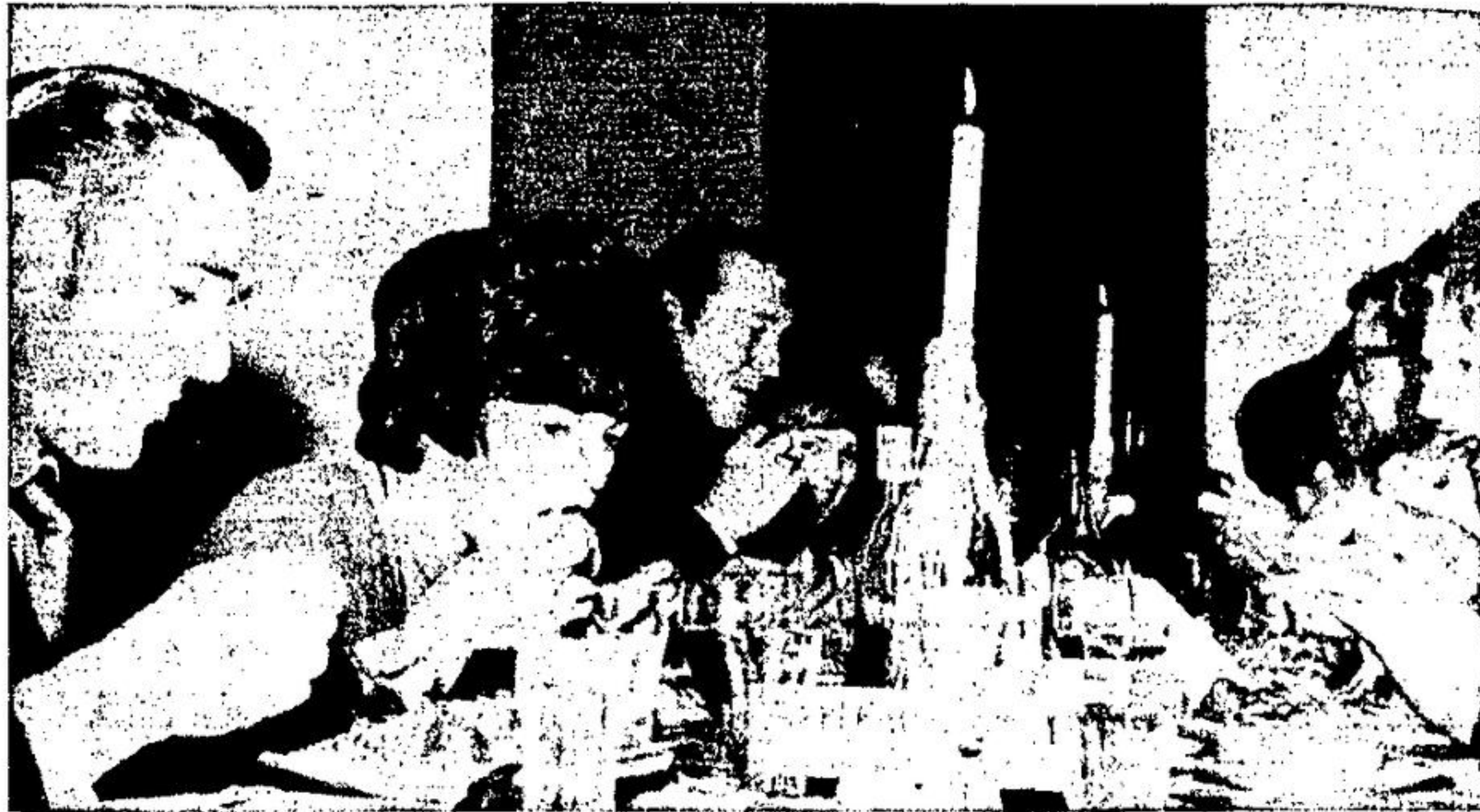
Enjoying the spaghetti and meatballs at Catholic Women's League Italian Nite.

The CWL's next big function is their annual Christmas bazaar December 5.