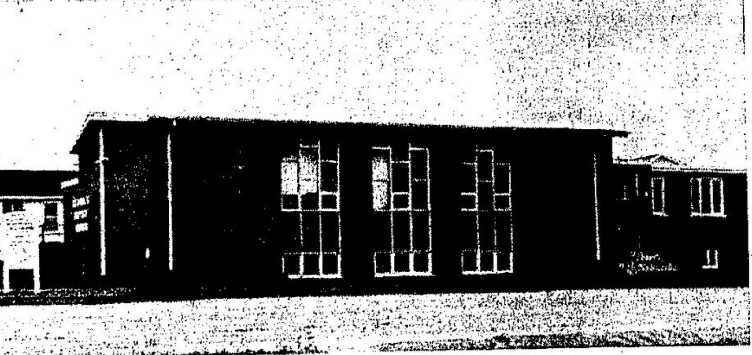
St. Paul's Baptist Church on Mountainview Road

A name for the new church will be decided on at a later date. It's likely one of the two church buildings will be disposed of, however, the future of the properties is one of the major points still to be dealt with.