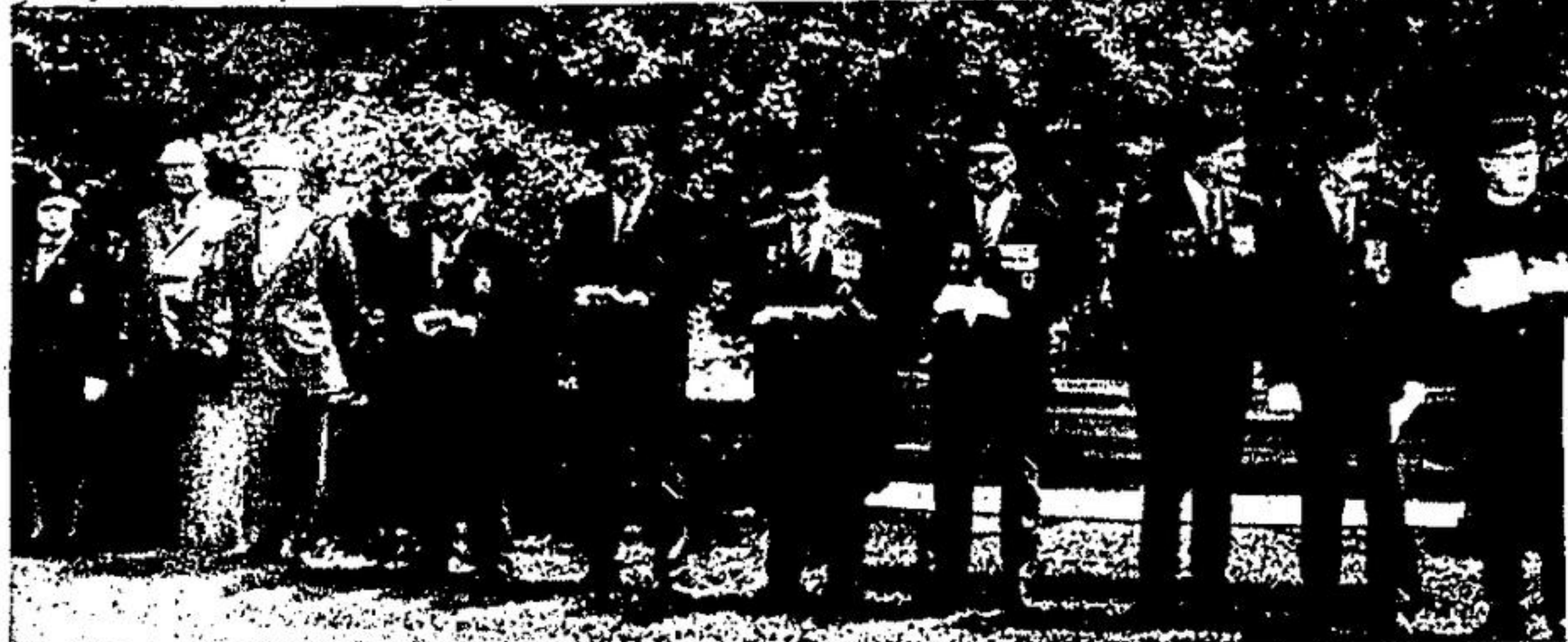
Local and visiting V.I.P.'s

Mark was bred by the Cara Mia Kennels in Milton.