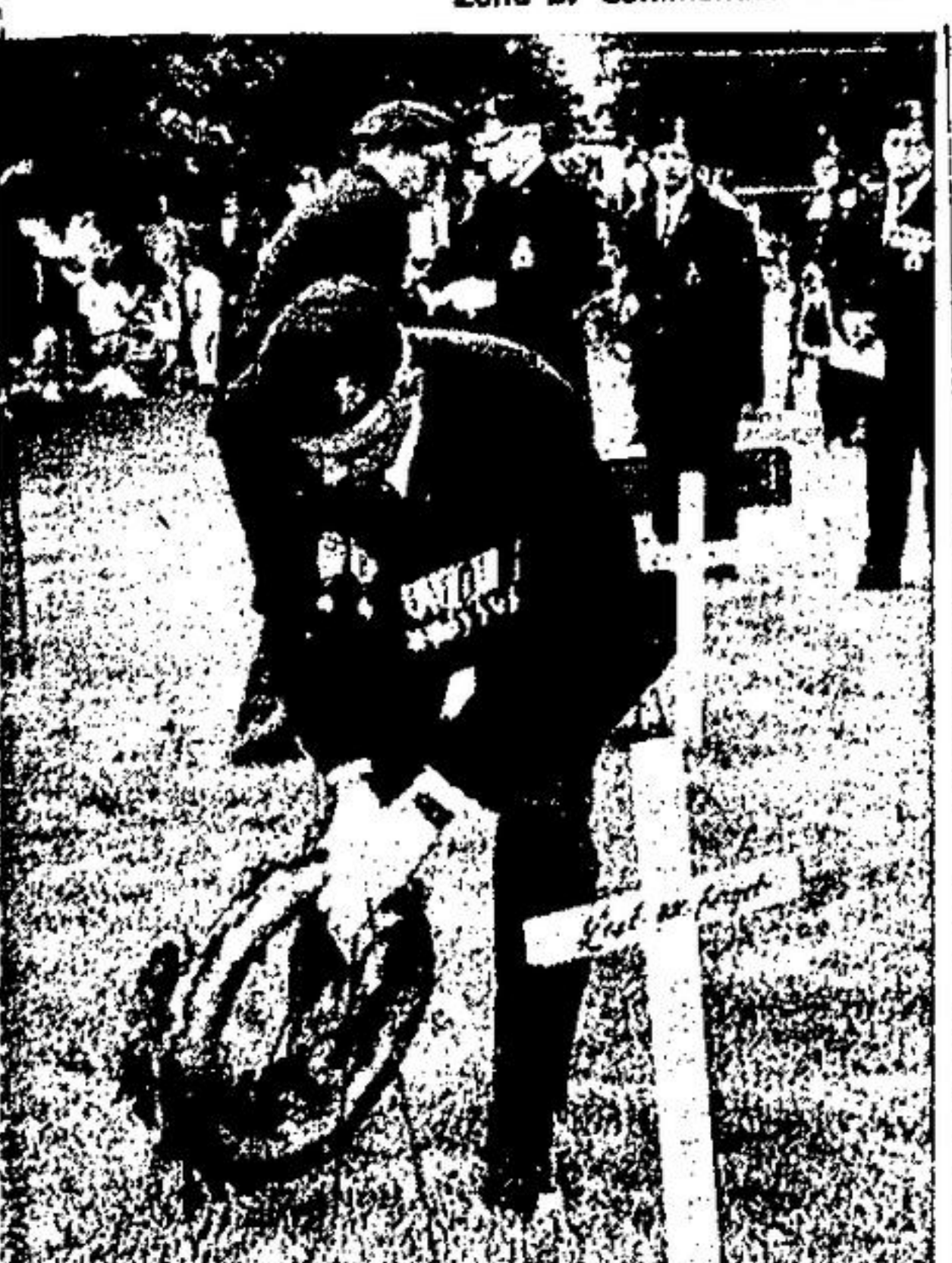
The laying of wreaths was part of cemetery service.