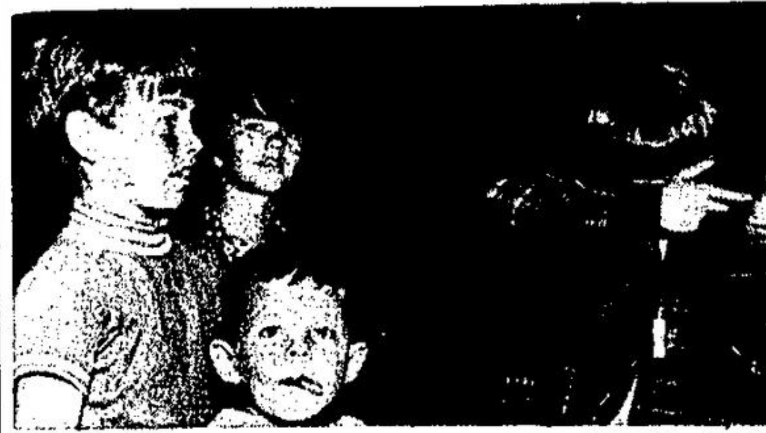
DEAD EYE TAKES DEAD AIM

An extensive, modern camp site is planned for tourists only, with no permanent guests. The season will run from May till September.