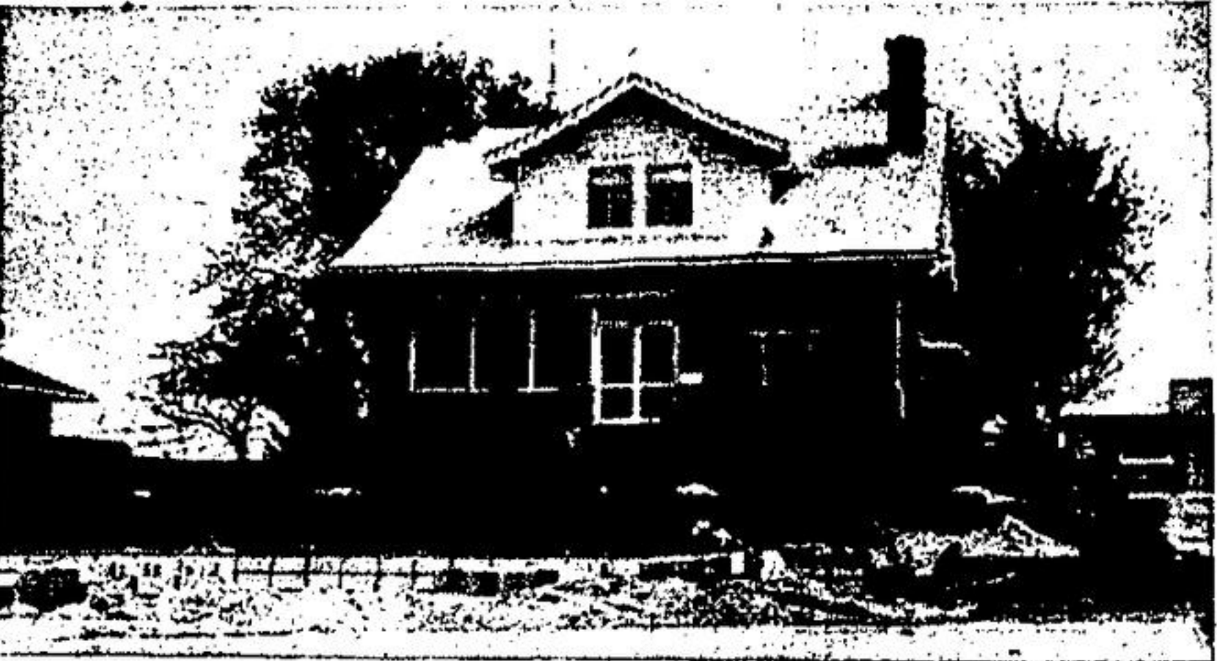
Half a lawn and mature cedar hedge bowed to progress from in front of this house at the corner of Edith Street and Maple Avenue.

By the beginning of August the chaos on Maple Ave. West should be transformed into a finished two lane road, with an extra lane for slow moving traffic up the hill from Main to Edith Street.