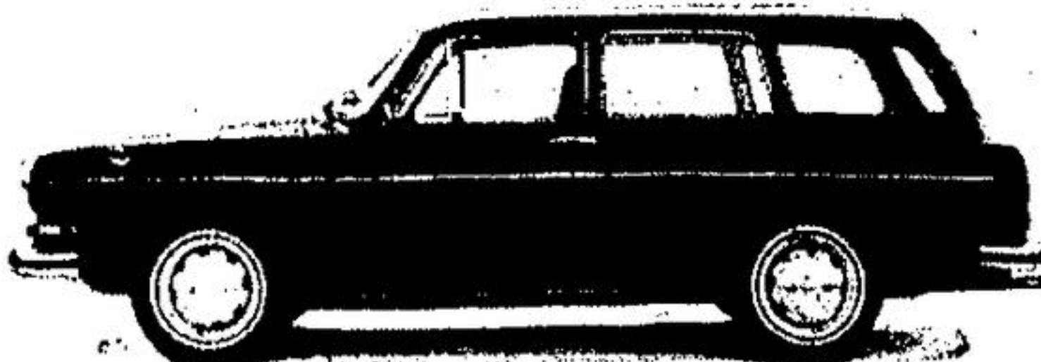
The Volkswagen Squareback Sedan.

Getting a 3' high object into a 2' high trunk is a neat trick. If you can do it. But when a Volkswagen Squareback Sedan gets into the act, the problem disappears. How? Just open the Squareback's big back door and abracadabra, 42 cubic feet of thin air for the problem to disappear into. But here's the best trick of all: when you're through using it as a station wagon—Prosto-Changeo! It turns into a family sedan. Ladies and gentlemen: the VW Squareback Sedan. Now... Do we have any volunteers from our audience?