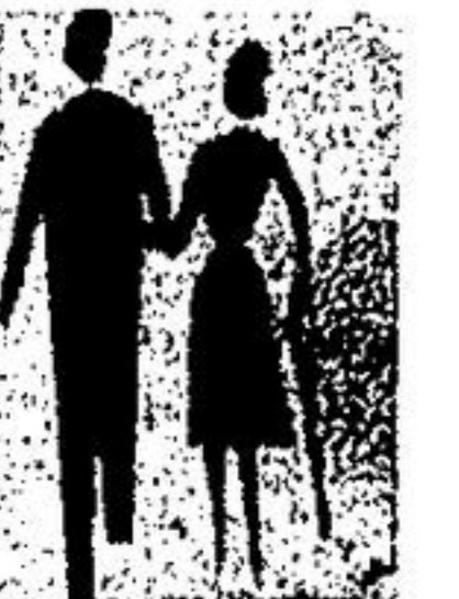
White Cane Travel