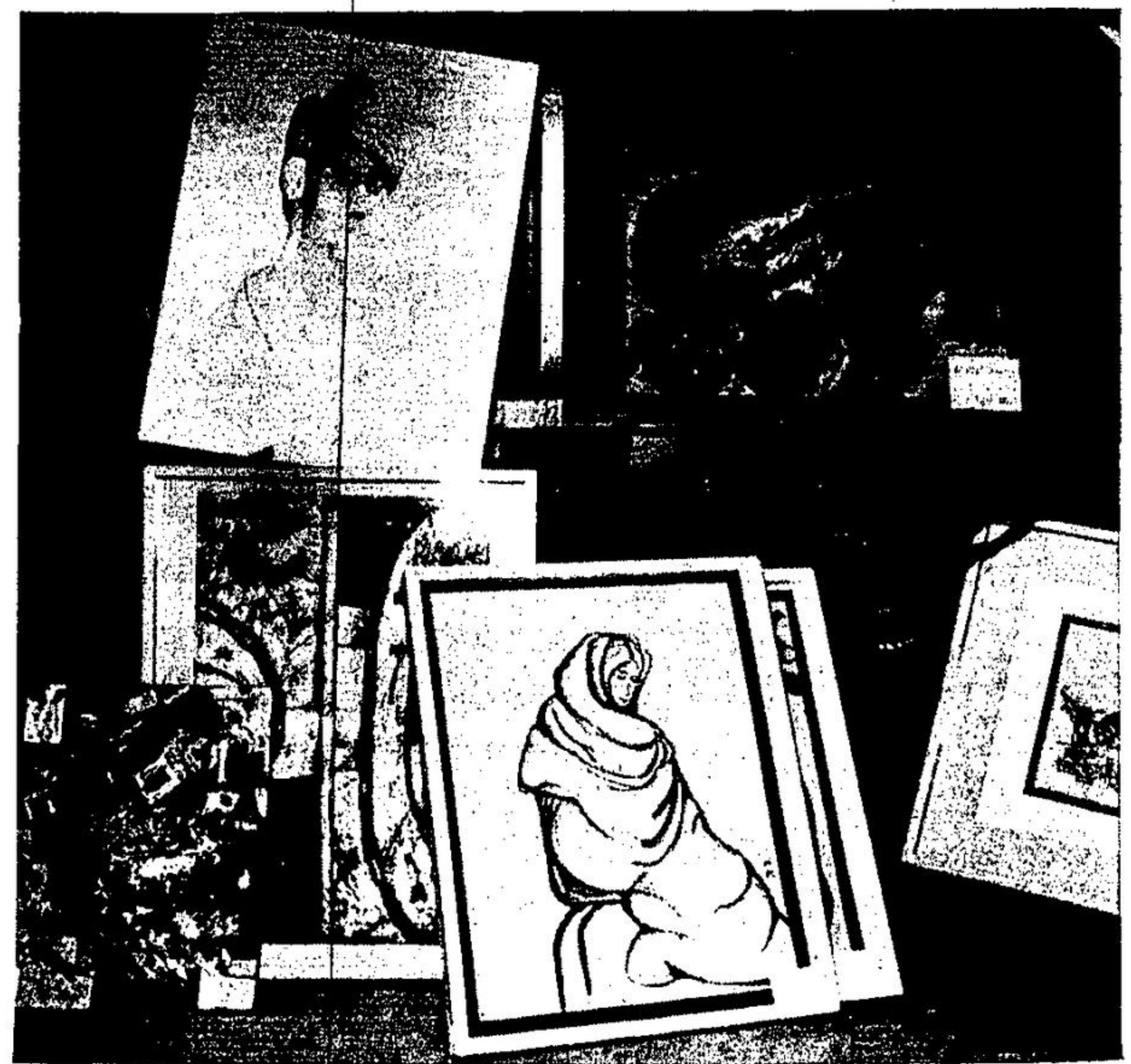
Examples of school art which will be in an exhibition at Georgetown high school May 13th and 14th.