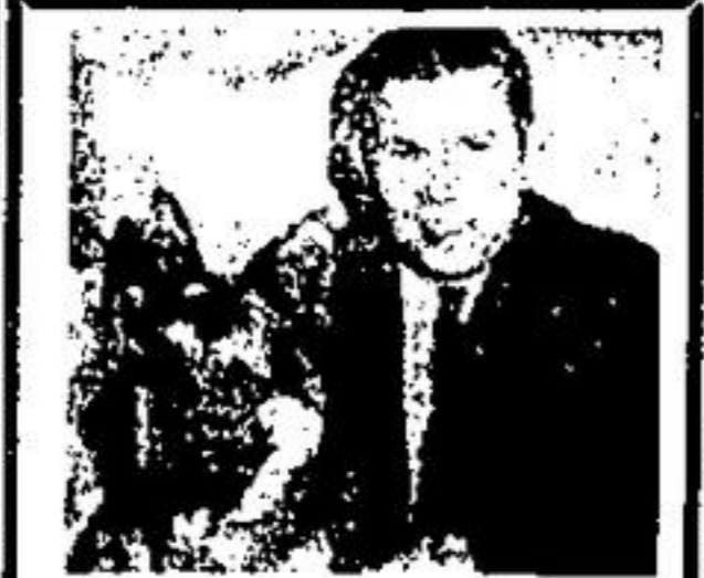
Protection Anyone? JOHN R. LEWIS INSURANCE Tel.: 459-9052