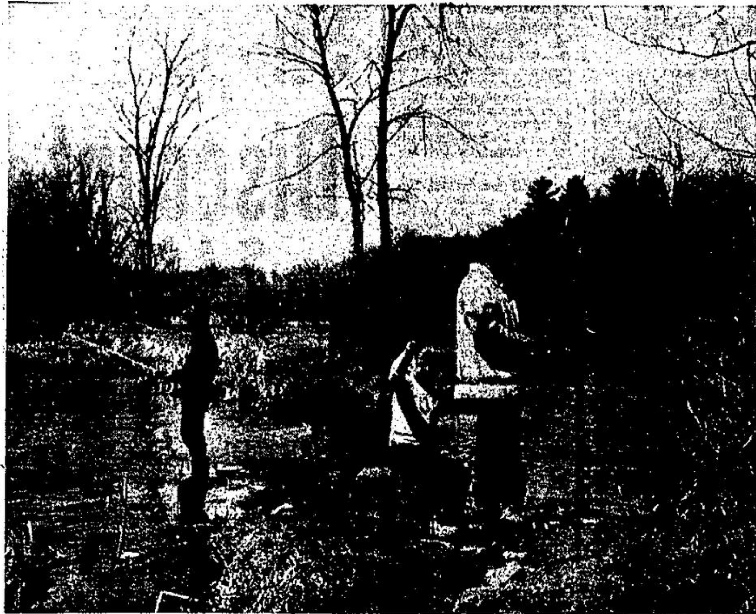
NOT SHOULDER TO SHOULDER, BUT BACK TO BACK

At the mouth of the Beaver River at Thornbury and other such popular spots on the first day of the trout season the anglers were shoulder to shoulder. On the Credit they're back to back. Here Lenny Sunnucks drowns a worm on the left side of a piece of high ground near the paper mill dam, while at right Bill Spence tries his luck. Holding up the one that didn't get away is little Alan Spence.