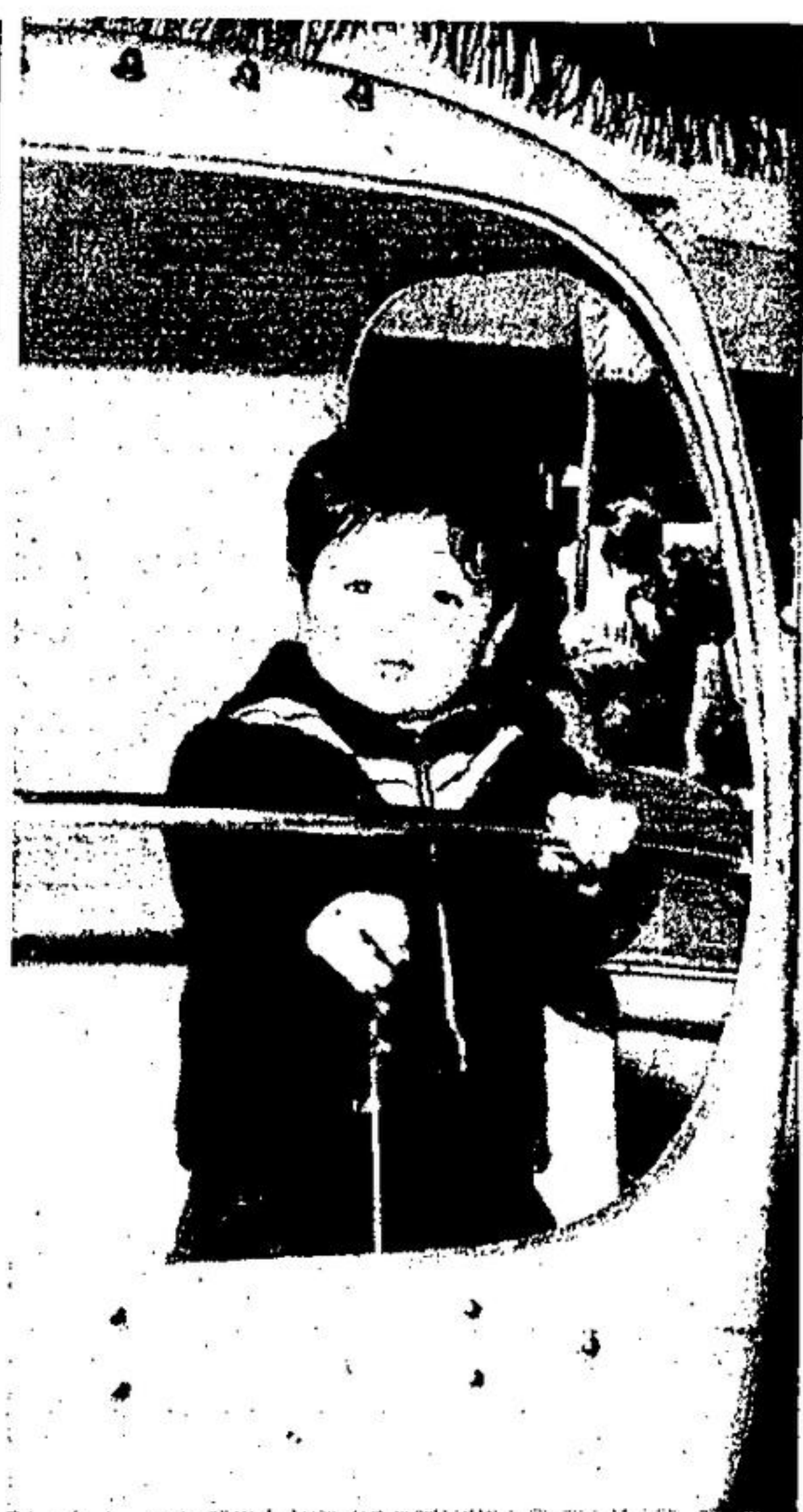
The space age and a space ship with blinking lights is more to this lad's liking.