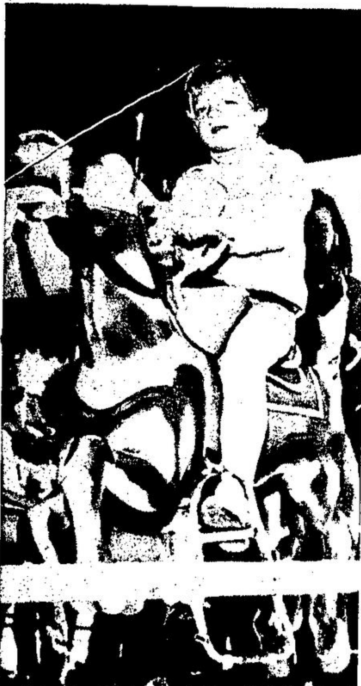
This little cowgirl finds the job has its ups and downs.

Happiness for a lot of local small types last week was travelling in happy circles, be they horizontal or vertical, at Georgetown Market, where Imperial Rides were whirling during carnival week. All the traditional attractions of a fall fair midway, merry-go-round, ferris wheel, space age ride, rockplane, and scrambler, and even candy floss, candy apples and pop corn had a magnetic pull for children of Georgetown Market shoppers and passers-by. At left, a member of the merry-go-round posse gets a hand from dad as he prepares to go galloping off in pursuit of the bad guys.