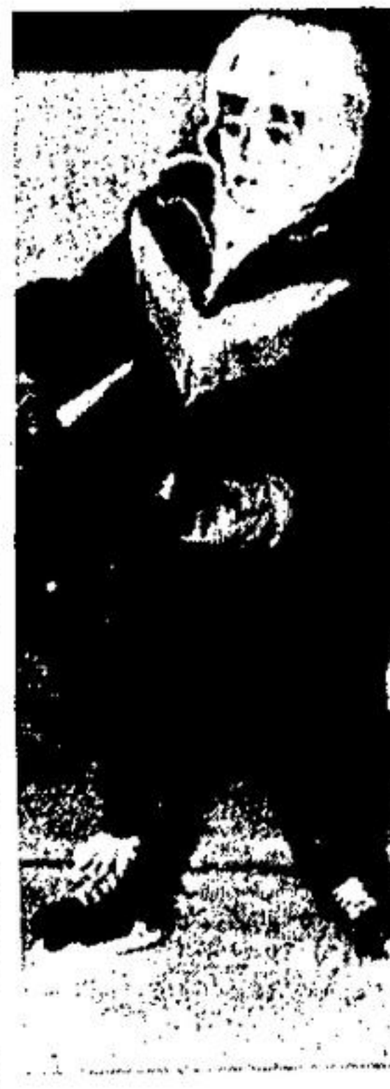
"Maybe I could sneak in a figure eight."

They will be supported by a cast of 200 young skaters as munchkins, poppies, children of Oz, guards of the wizard, fighting trees, quaddings, and winged monkeys.