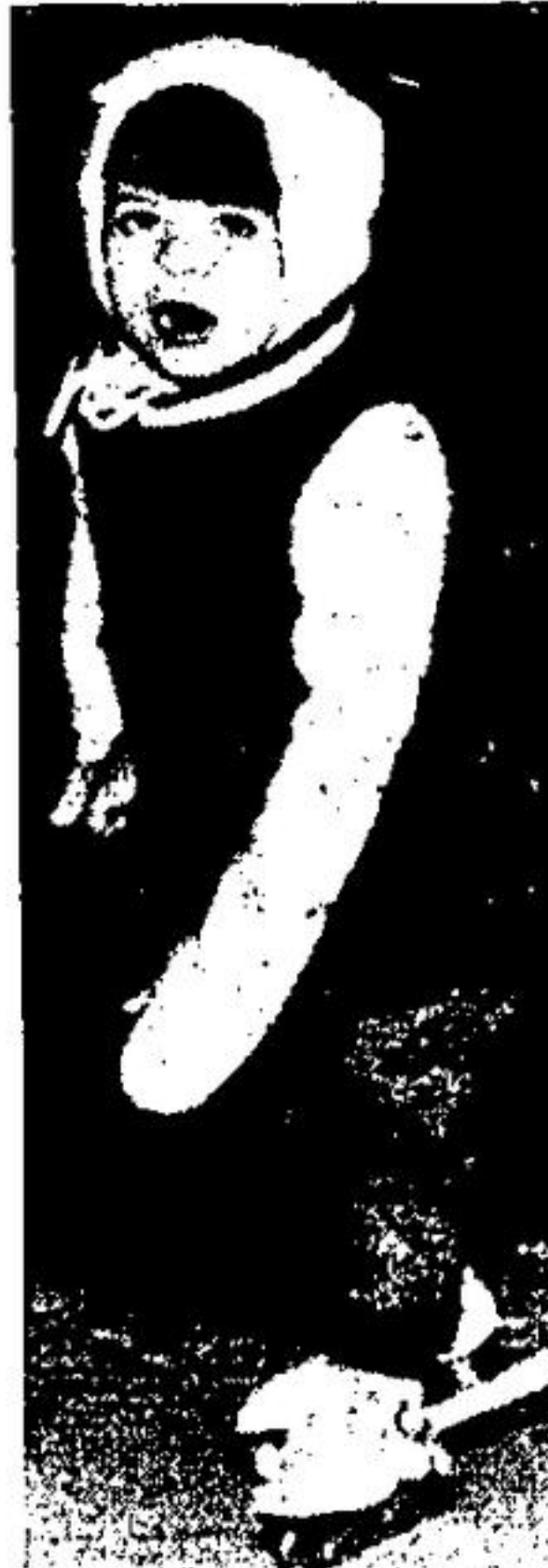
"Wonder if I'll be discovered."