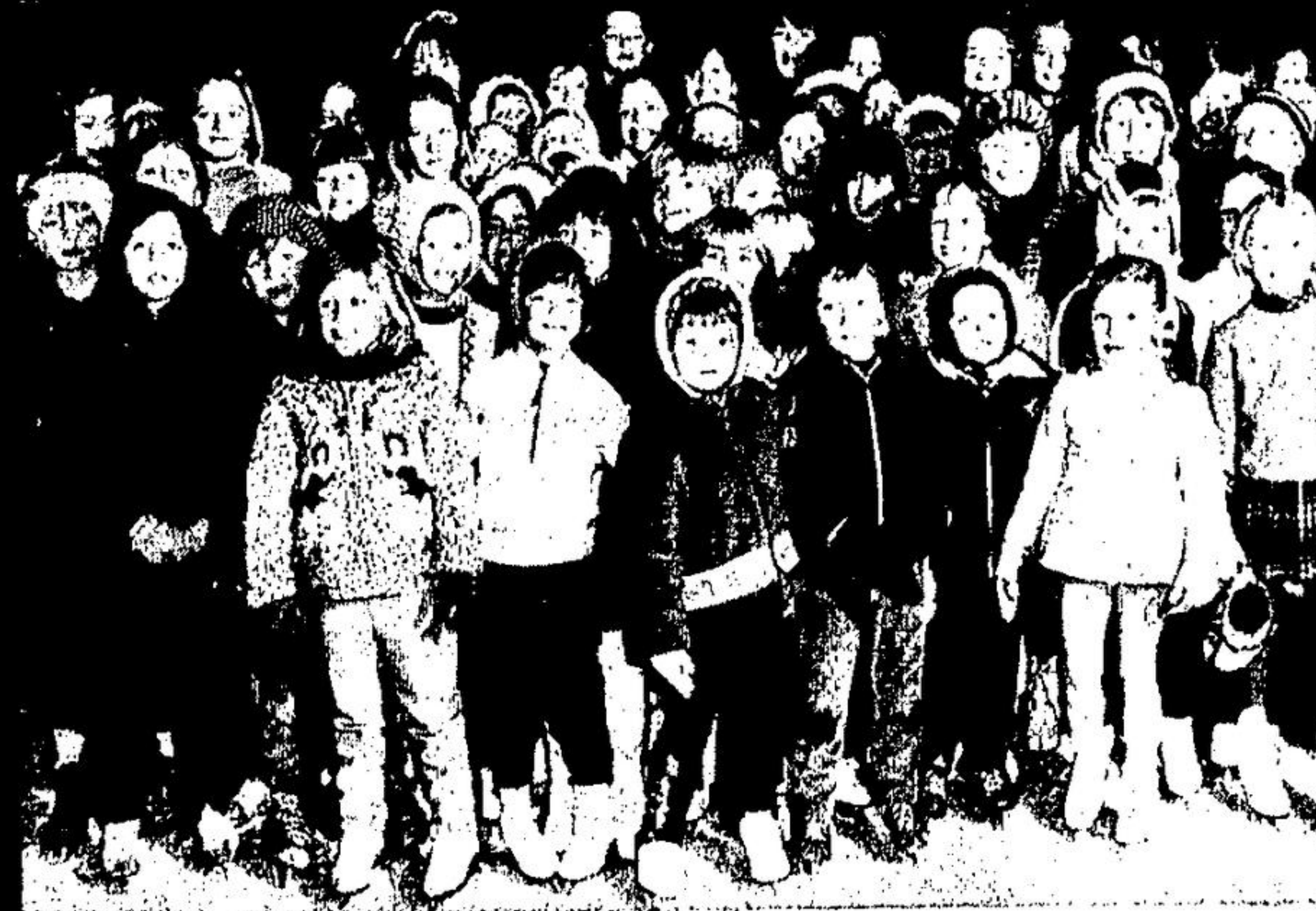
Junior skaters who play Fighting Trees, Quaddings, and Winged Monkeys in The Wizard of Oz.