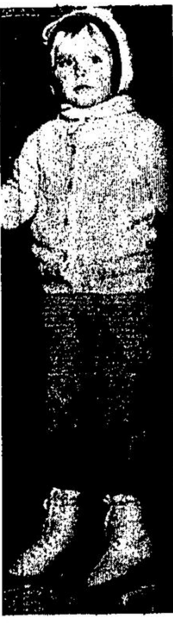
"Anybody here scouting for Ice Capades?"