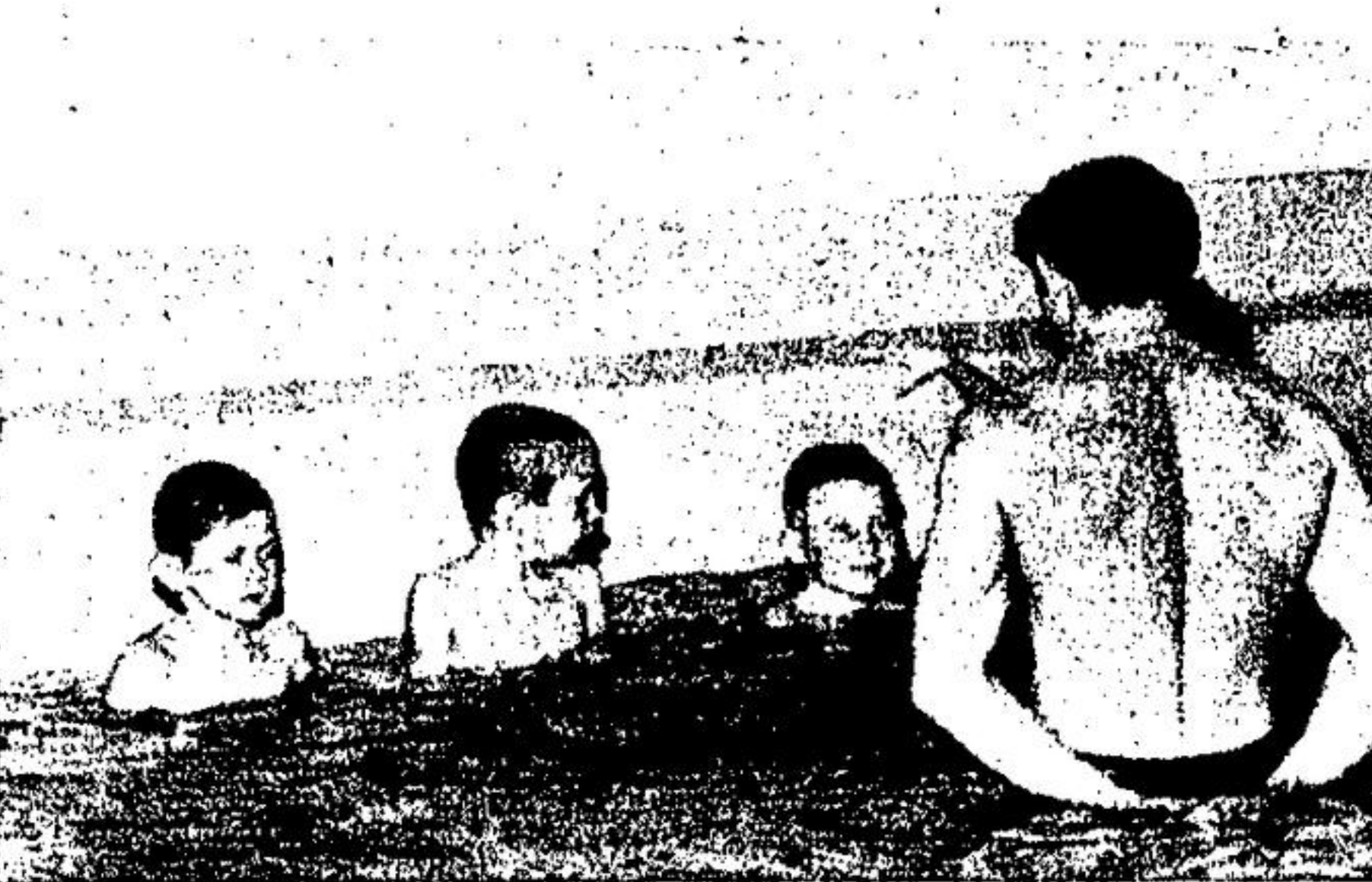
Wading and waiting for instructions at the beginners swimming class at the Alpine pool.