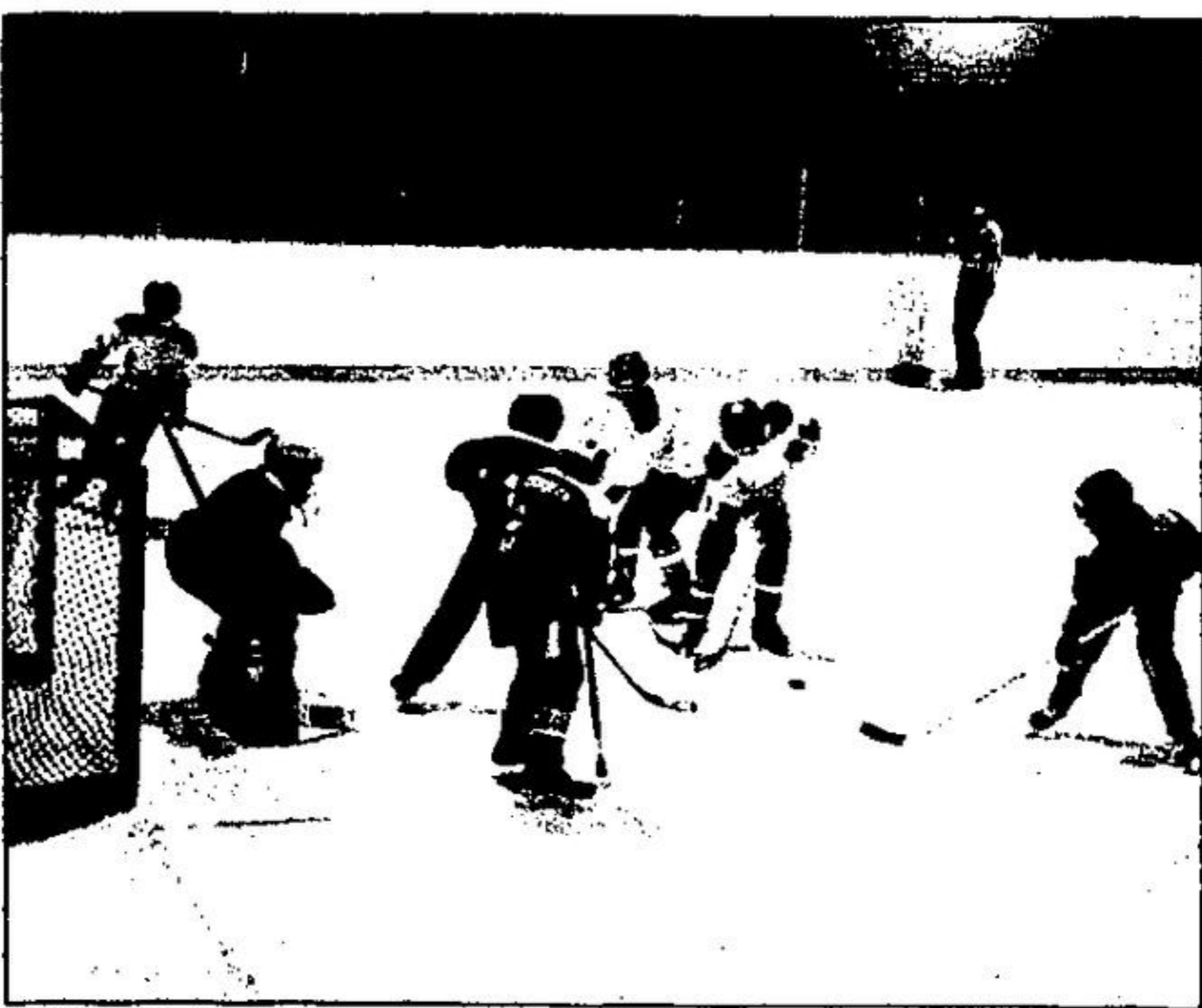
This week's feature team is Cleveland and in this week's action, the honored Pee-Wee squad tied Rochester 3-3.