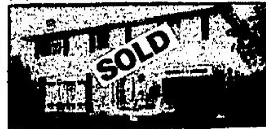
GUEY CRESCENT $108,900

32 Bed. apartment, store plus separate 3 bedroom home. Property is in excellent condition. Call Damian. RTB4-212