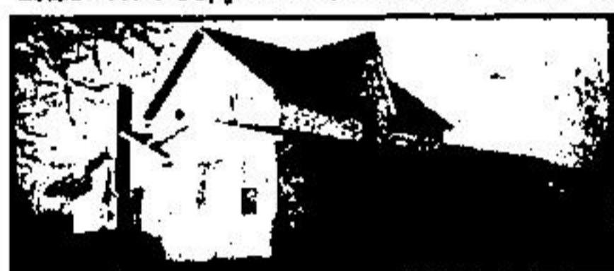
NEW LISTING COUNTRY LOCAL

132 x 165 lot. 3 bedroom residence needing work. A brick classic model of a by gone era. Peter Thornton. RTB4-273