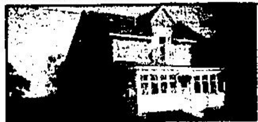
VICTORIAN STYLE $61,900

10 rooms give you some idea of the size this old world traditional home has. Features just too numerous to mention range from oak pegged floors to circular study. Like to hear more? Please call Peter Thornton. RTB4-279