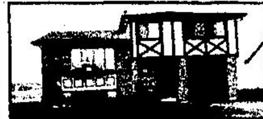
NEW LISTING BLAME OFFERING

58 Acres, 3000 sq. ft. 6 year old custom built home, barn plus 2 bedroom guest house. Listed at $248,900. Call Damian. RTB4-172