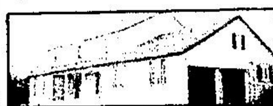
ON PAVED ROAD AND ONLY 8 MILES FROM 401

Superbly done throughout, 4 bed. finished lower level plus much more. Call Damian. RTB4-216