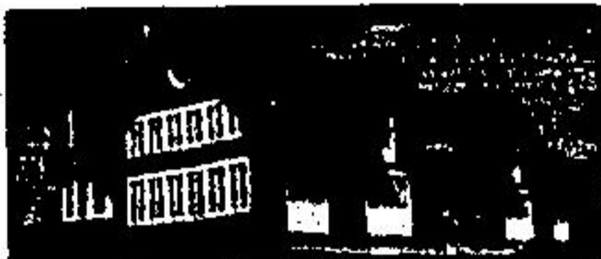
TRULY UNIQUE PROPERTY

On quiet cul de sac near lake and school. 4 Bed. main floor family room with stove, kitchen with walkout to deck overlooking lake, plus many other fine features. Call Damian now. RTB4-233