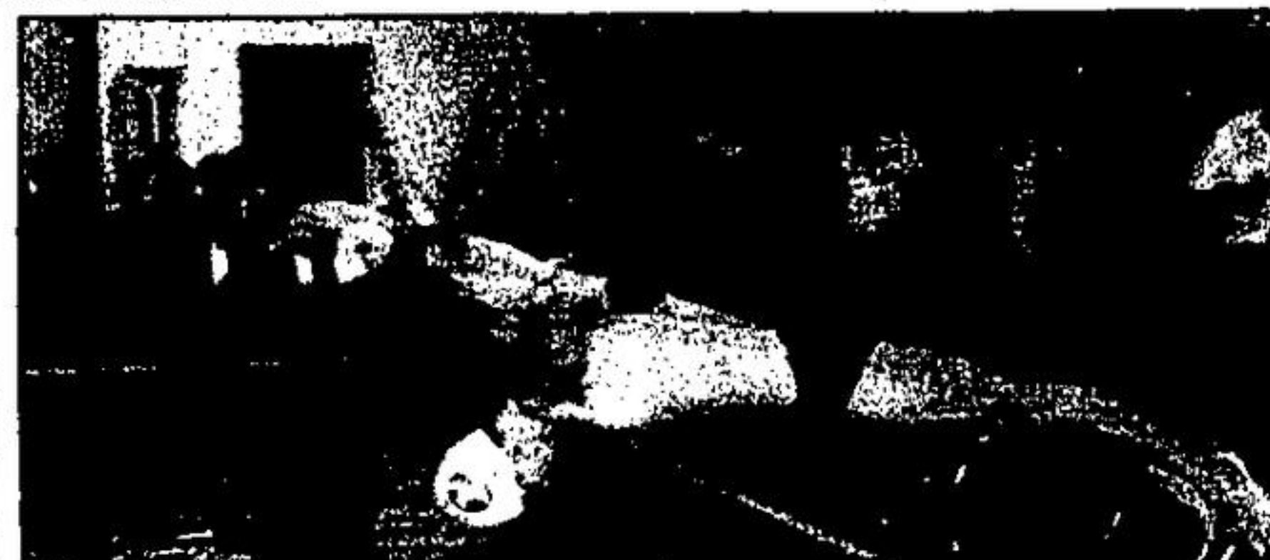
Off and swimming! Youngsters from the Swimming Stars of Acton and the Kitchener-Waterloo Swim Club did battle in a dual meet at the Acton Lions Indoor Pool on Sunday morning.