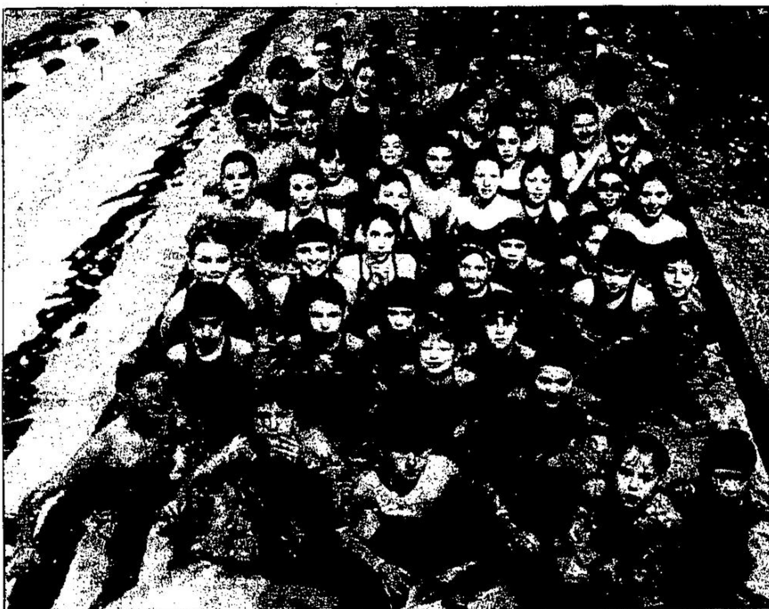
The Swimming Stars of Acton recently competed in the South Western Ontario Regional Swimming Association (S.W.O.R.S.A.) competition and came up with some impressive performances. Sunday the Swim