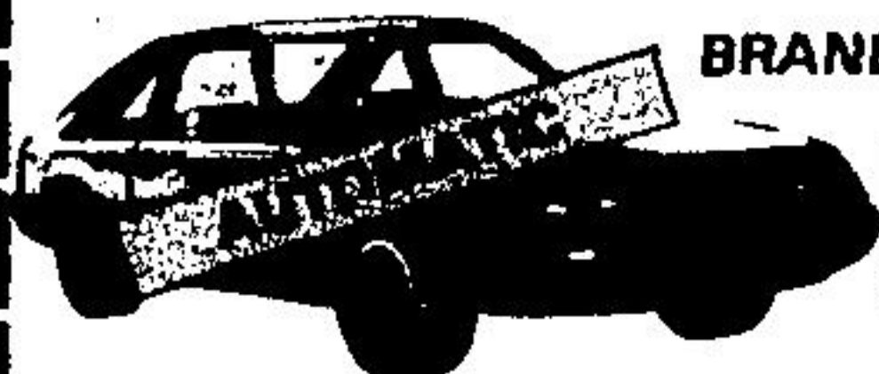
BRAND NEW '85 MUSTANG LX

2.3 L engine, automatic trans., power brakes, power steering, electric defroster, reclining seats, etc. LEASE $189* PER MONTH