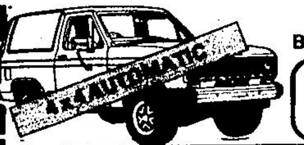
BRAND NEW '85 BRONCO II

8 cyl. engine, automatic overdrive trans., power steering and brakes, electric defroster, split seats, VSW tires, lux. vinyl roof, etc. LEASE $285* PER MONTH