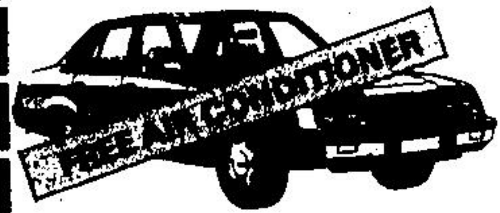
BRAND NEW '85 LTD

2.00 engine, automatic trans., power brakes, power steering, electric defroster, H.D. battery, paint stripes, reclining seats, etc. LEASE $179* PER MONTH