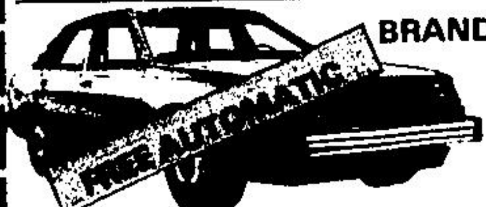
BRAND NEW '85 TEMPO L (2 door or 4 door)

2.3 L engine, automatic trans., power brakes, power steering, electric defroster, reclining seats, etc. LEASE $189* PER MONTH