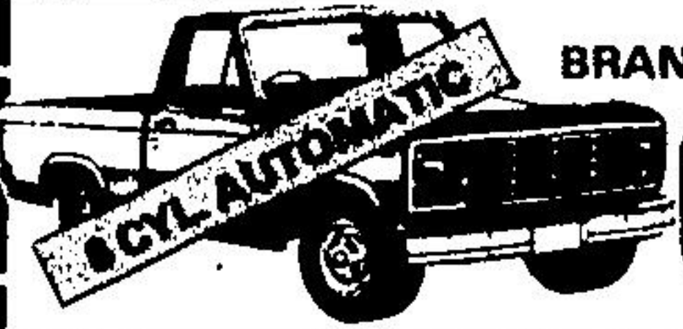
BRAND NEW '85 F-150 PICK-UP

8 cyl. engine, 4 wheel drive, automatic overdrive trans., power steering, power brakes, carpets, tinted glass, rear seat, H.D. battery, etc. LEASE $279* PER MONTH