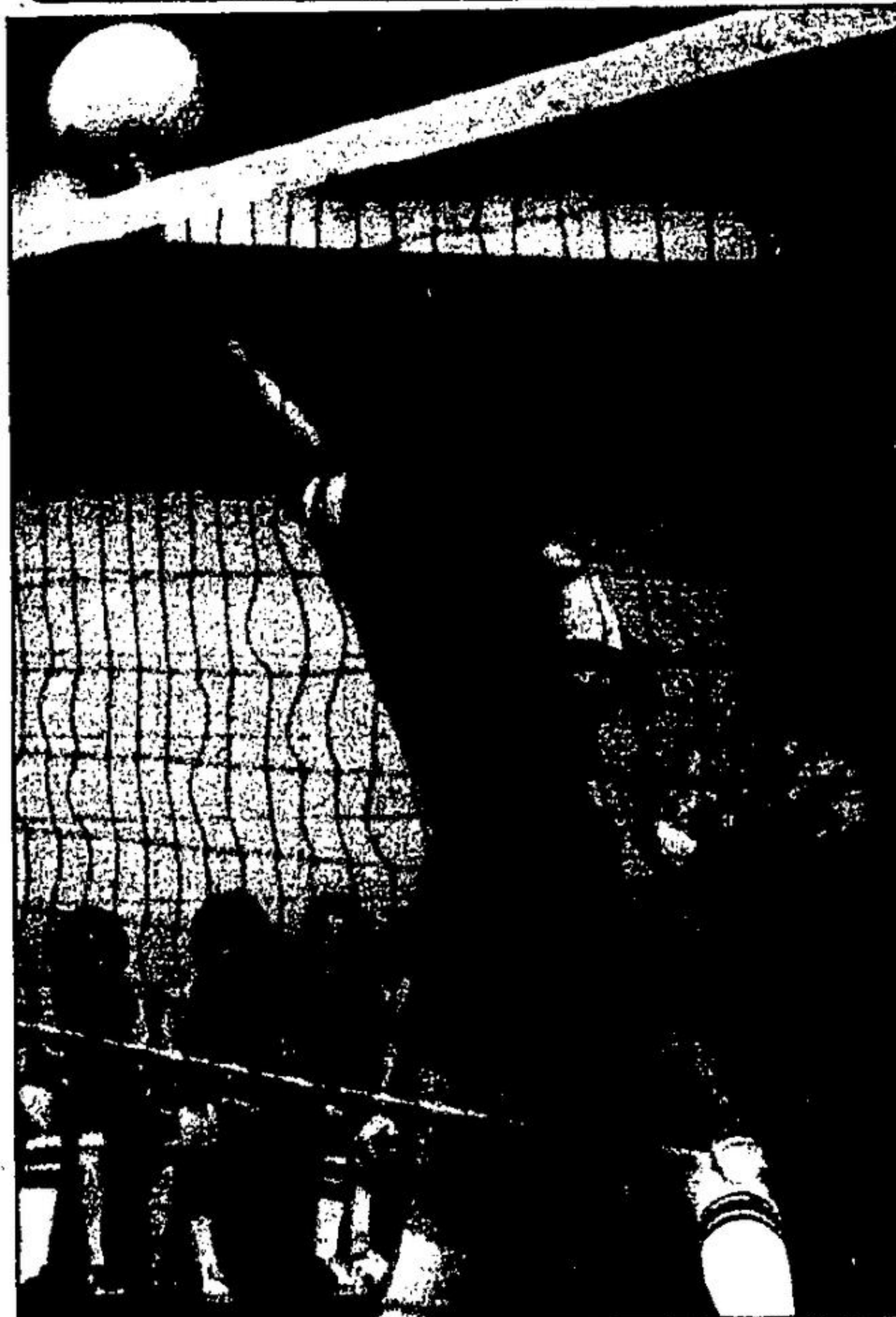
Up, up and over goes the ball as a McKenzie-Smith player nudges the ball into the Stewarttown court in volleyball action at McKenzie-Smith Thursday.