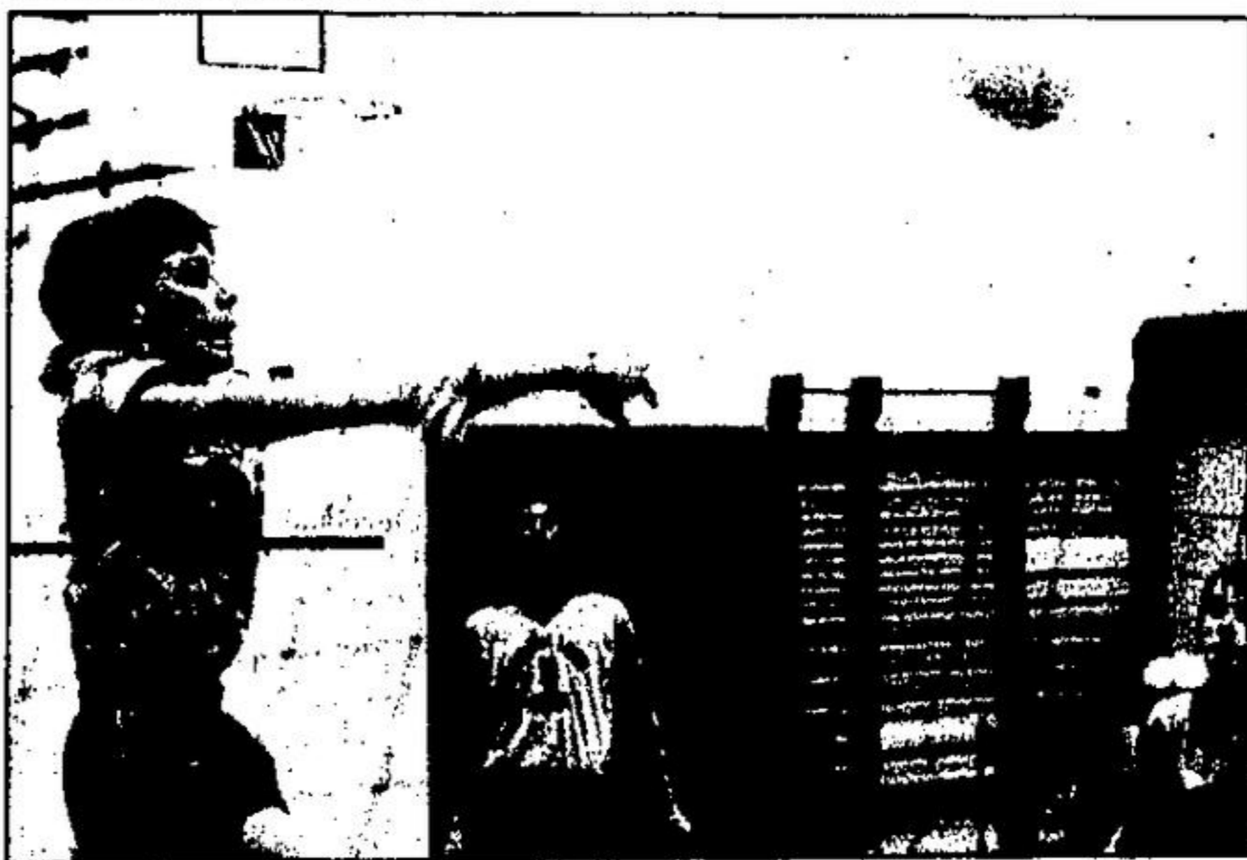
A McKenzie-Smith player (left) looks like he's pushing the ball over the net. The McKenzie-Smith Mustangs faced some tough competition against Stewarttown but they came out ahead with identical 15-13 victories.