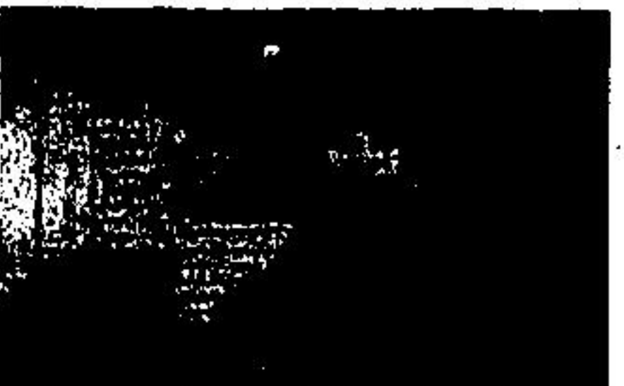
BETTY ANNE WALL