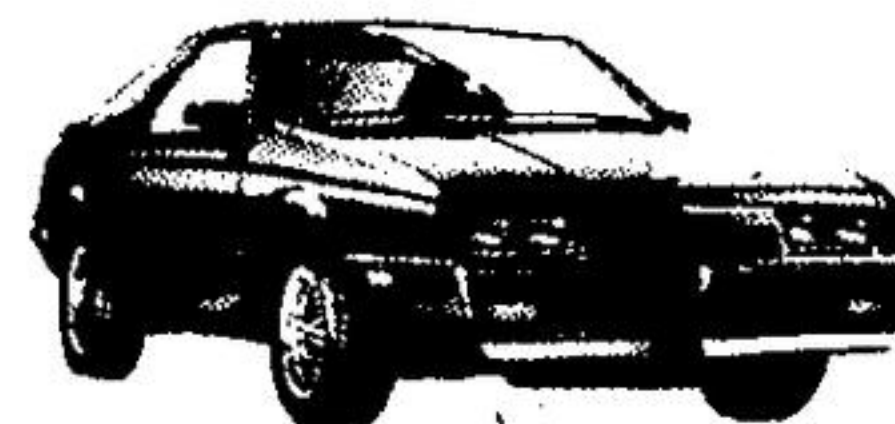
1984 LASER 2 DOOR HATCHBACK

$10260 20 plus $1.00 = $10261 20 (plus freight)