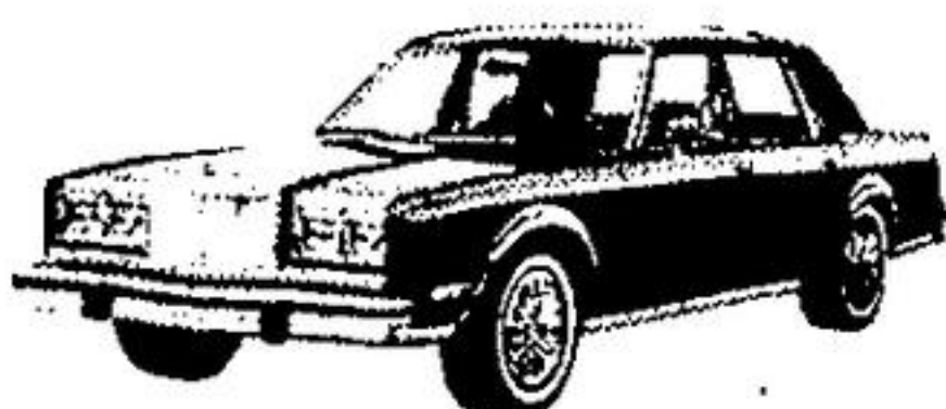
1984 CHRYSLER NEW YORKER 5TH AVENUE

$15771 85 plus $1.00 = $15772 85 (plus freight)