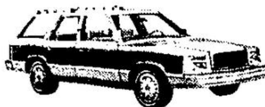
1984 ARIES CUSTOM 2 SEAT STATION WAGON

$11732 85 plus $1.00 = $11733 85 (plus freight)