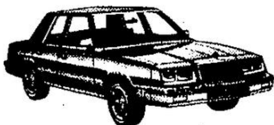
1984 ARIES 2 DOOR SEDAN

$14310 30 plus $1.00 = $14311 30 (plus freight)