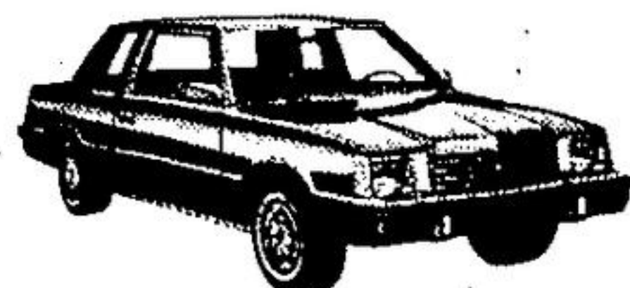
1984 LeBARON 4 DOOR SEDAN

$17105 10 plus $1.00 = $17106 10 (plus freight)