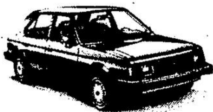
1984 HORIZON 5 DOOR HATCHBACK

Here are some examples of the fantastic deals being offered: