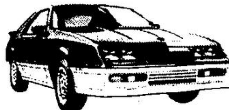
1984 DAYTONA TURBO 2 DOOR HATCHBACK

$7196 65 plus $1.00 = $7197 65 (plus freight)