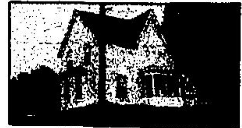
GEORGETOWN BETTER BUY!!

$69,900. Century home on extra large fully landscaped lot, large eat in kitchen, formal dining room, large living room with bay window & fireplace. Must be viewed. Call now for your appointment. Ed Allan 456-2200 after hours 877-7321.