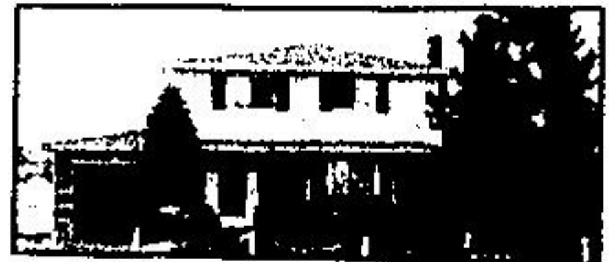
4 BDRM. QUIET CRESCENT GEORGETOWN

Asking $159,900. 10 minutes to town, 5/8 acre hobby farm featuring fantastic country home with dream kitchen plus most other features you want in that special home. Plus 2 barns and of course it's fully fenced. For more information on this exciting home call Ed Allan 456-2200 after hours 877-7321.