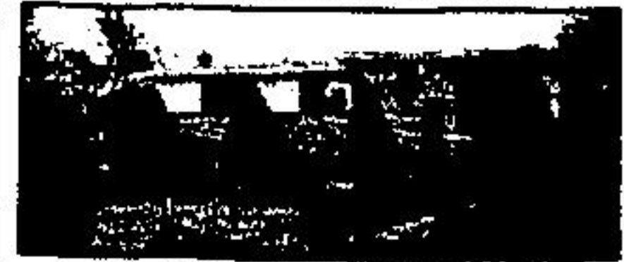
TIRED OF LIVING IN TOWN - BUT YOU STILL WANT THIS AREA?

$69,900. Century home on extra large fully landscaped lot, large eat in kitchen, formal dining room, large living room with bay window & fireplace. Must be viewed. Call now for your appointment. Ed Allan 456-2200 after hours 877-7321.