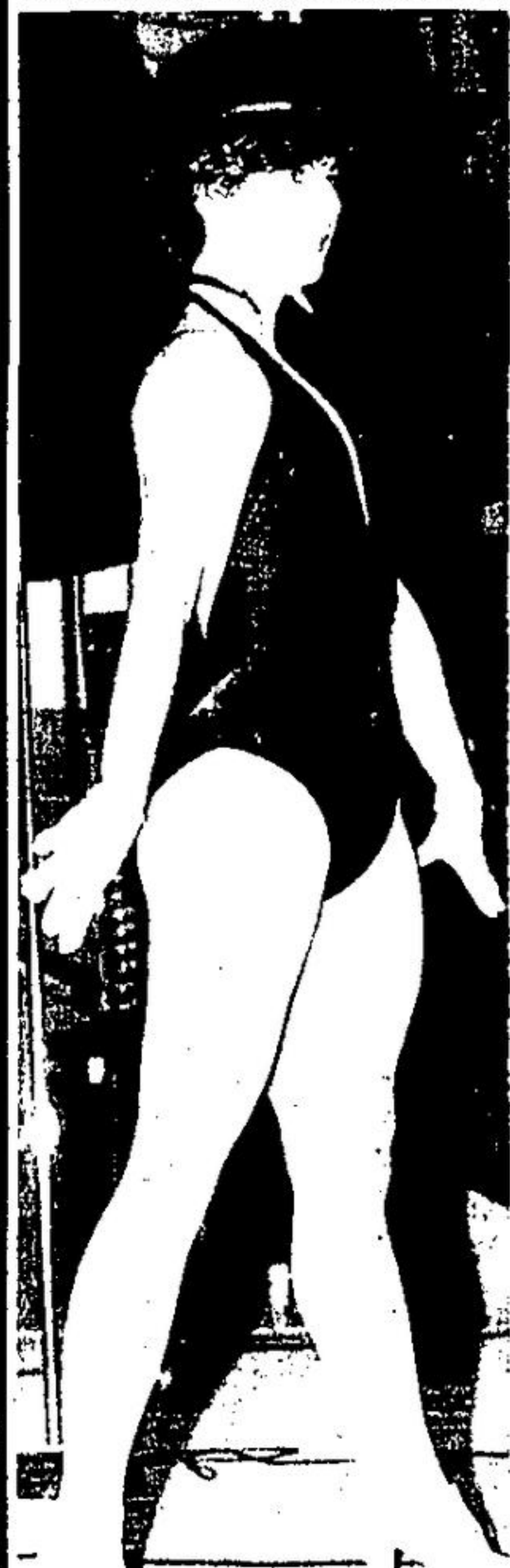
One of the "Dream Girls" struts her stuff during the Friday Night Show.