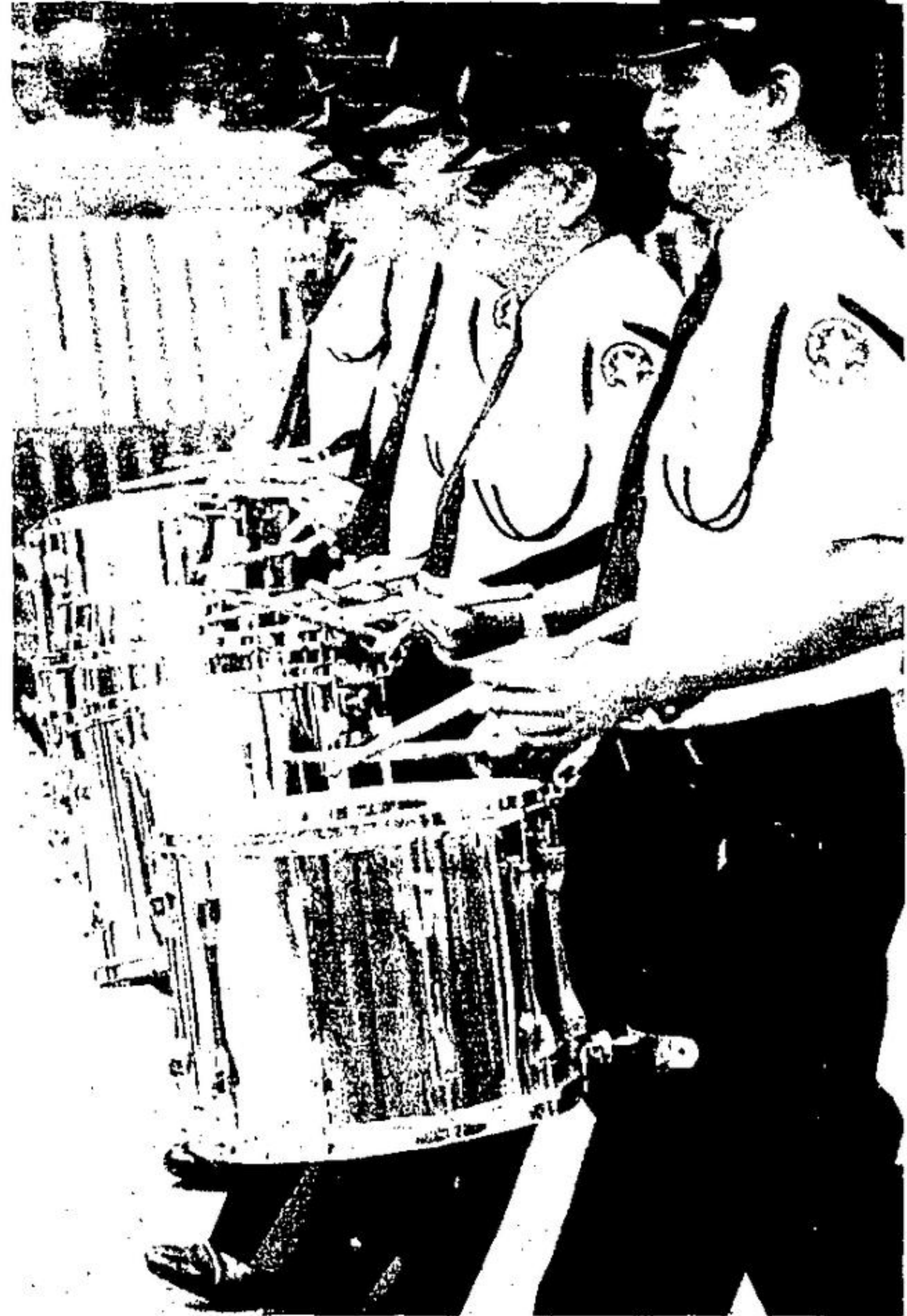
Marching bands of all types took part in the parade through the town into the fairgrounds Saturday at noon.