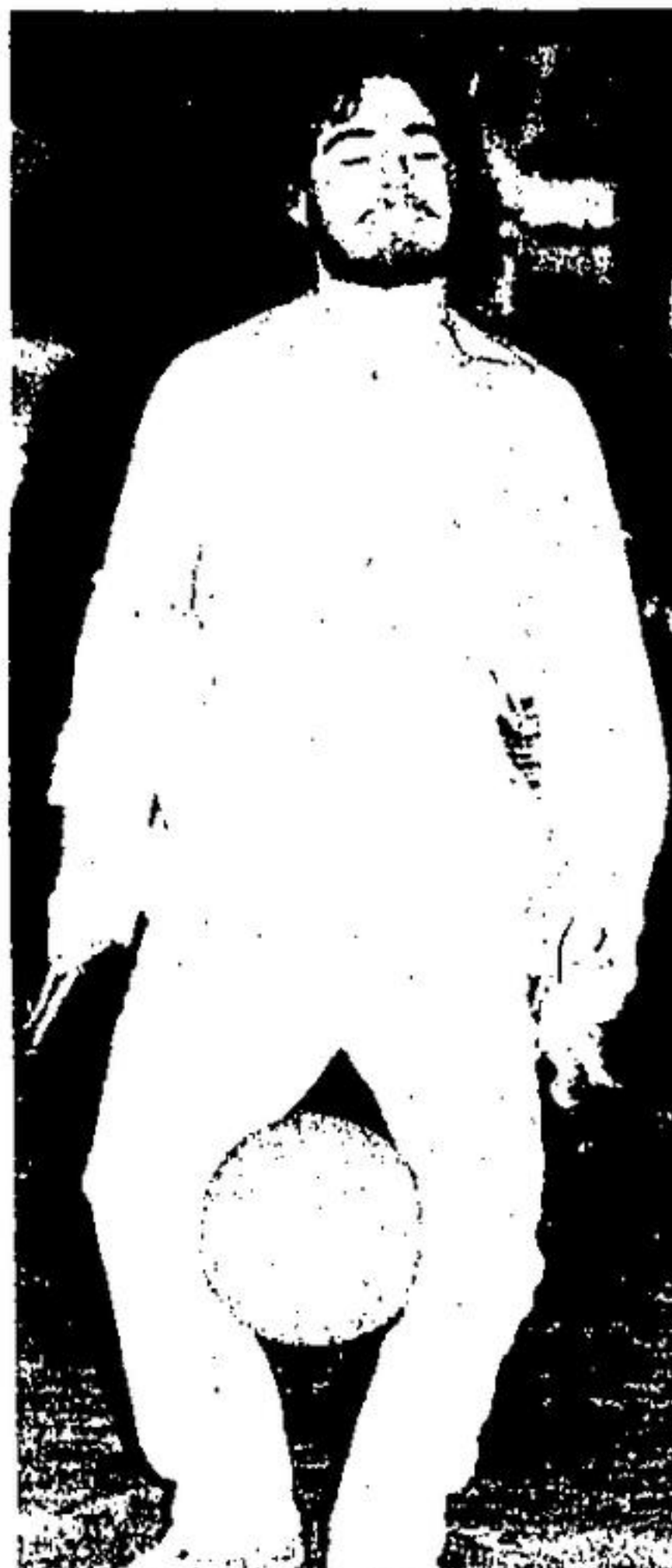
This Voyager was doing his part for the team as he carried a basketball from one end of the relay course to the other in the all-star competition at the fair Sunday.