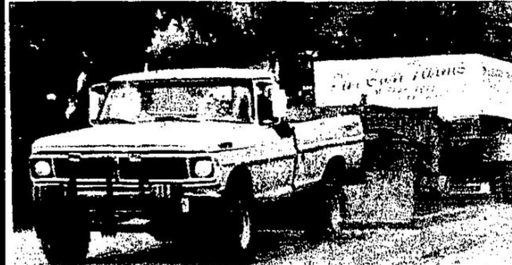
Fourteen four-wheel drive trucks took part in the 4x4 pull Sunday afternoon, providing the crowds with lots of excitement.