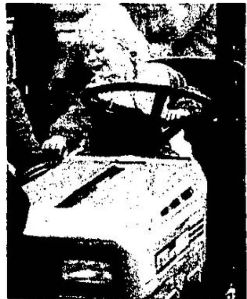
Between the livestock and the midway were a vast array of hawkers and salesmen competing for the attention, as well as the dollars, of passers-by cautiously glancing over their wares. This young lady test-drove a riding mower.