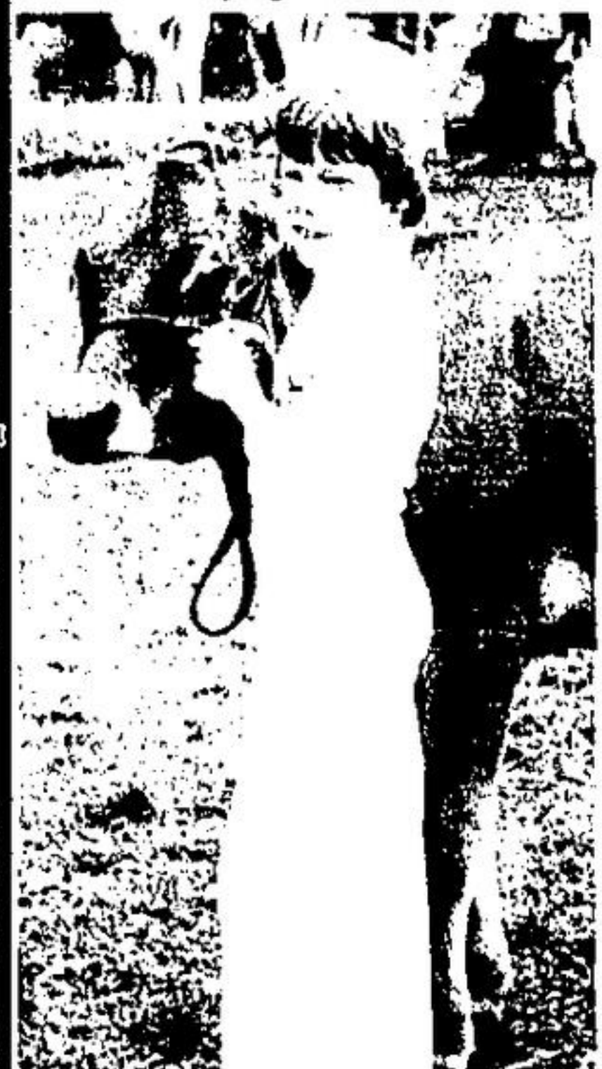
The dairy cattle show brought exhibitors from all around.