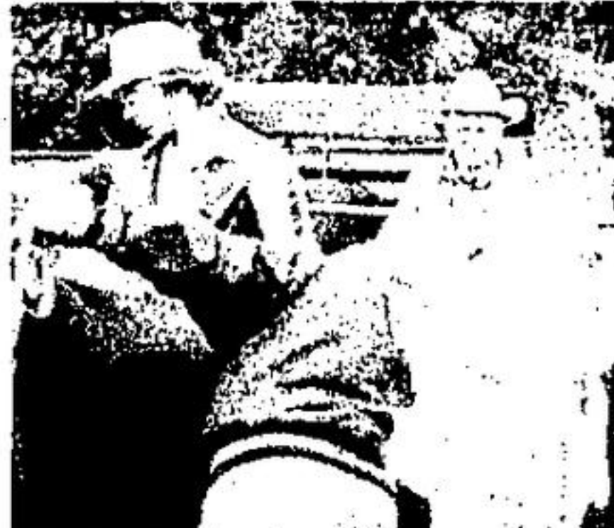
With the keen eye of a man who knows his business, this judge at the beef cattle show appraised the field. Entries were up in most categories again this year.