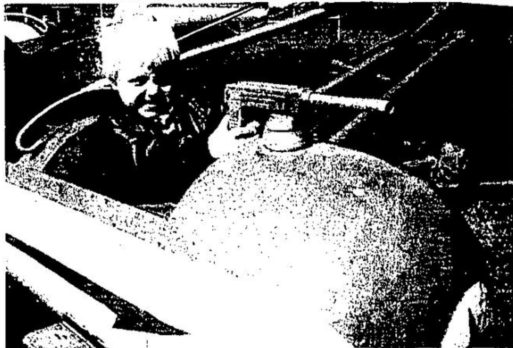
There was fun for all on the midway. The planes give this little guy a chance to shoot down all the "enemies" in the park.