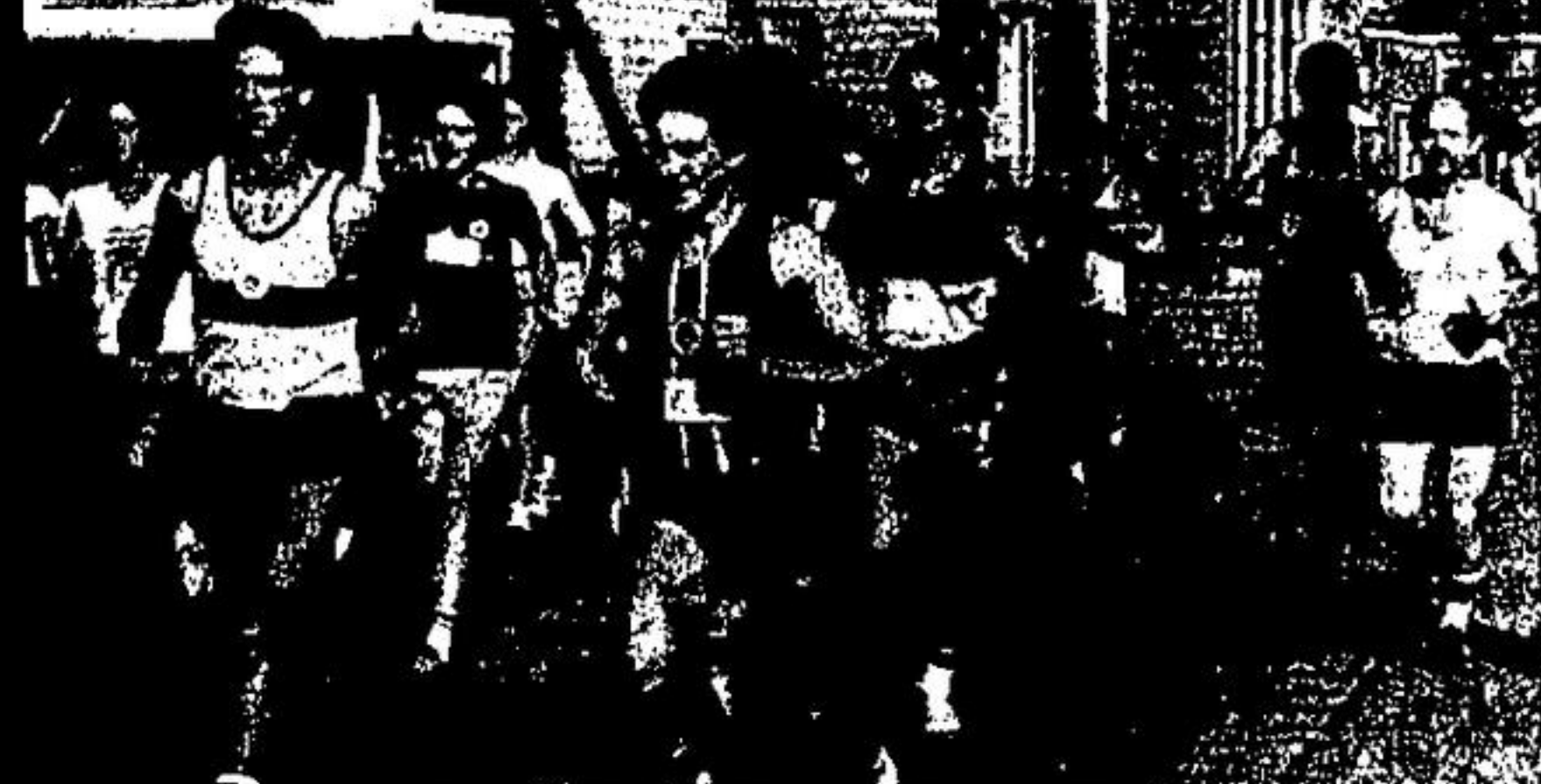
Runners in the five and 10-kilometre biathlon travelled through the streets of Acton to see which team could out-cycle and out-run the others.