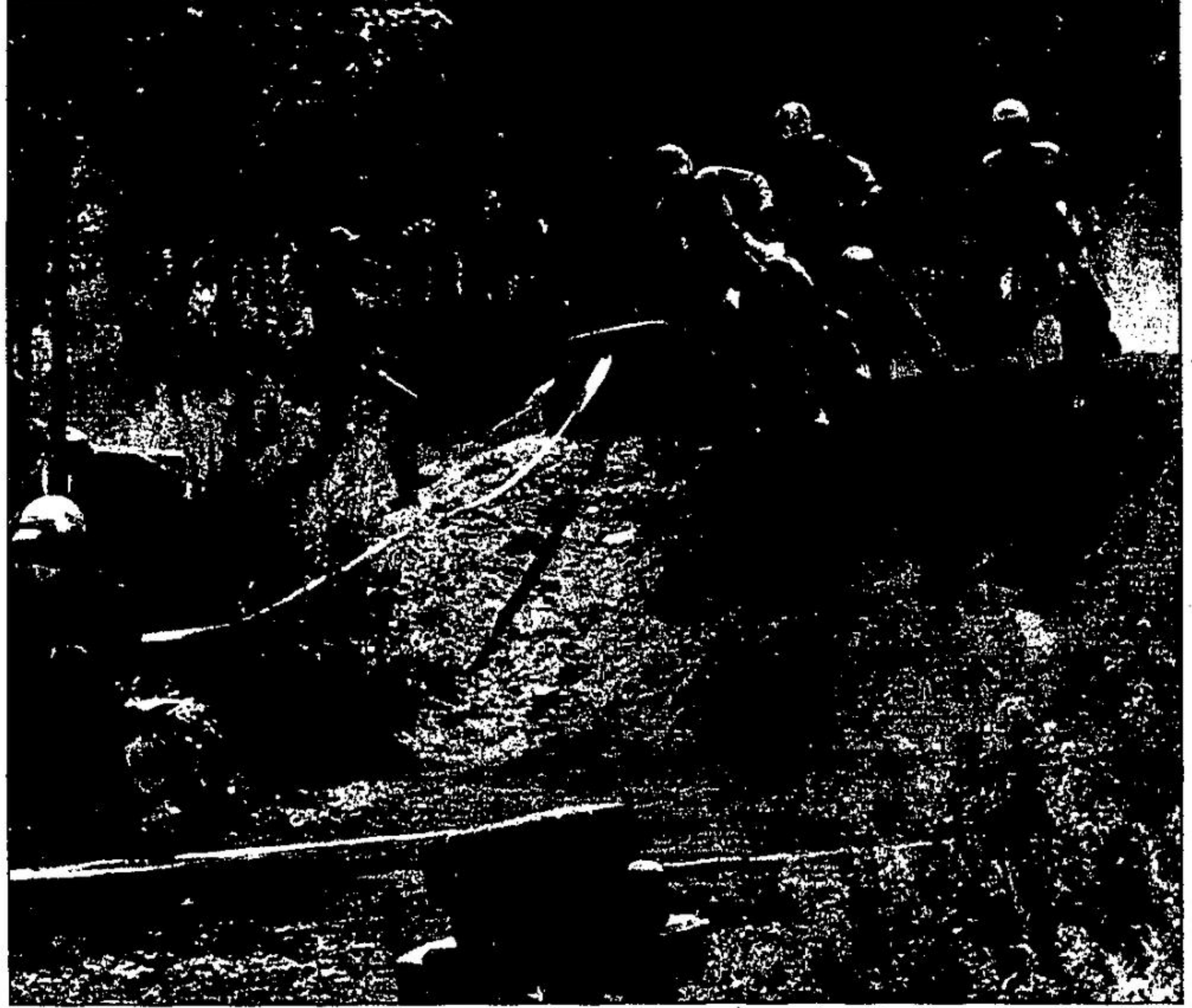
UP AND OVER. Moto cross racers from all over Ontario and parts of the U.S. were on hand at the Leathertown track Sunday to pit themselves against the winding, twisting track and each other.