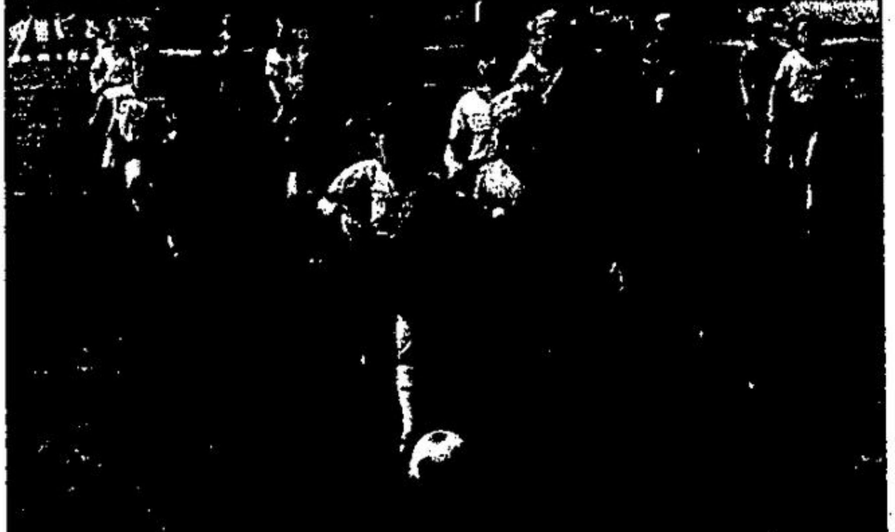
Mini-Squirt and Squirt boys and girls tested their skills against each other in exhibition soccer at Prospect Park Sunday. In this match, the boys beat the girls.