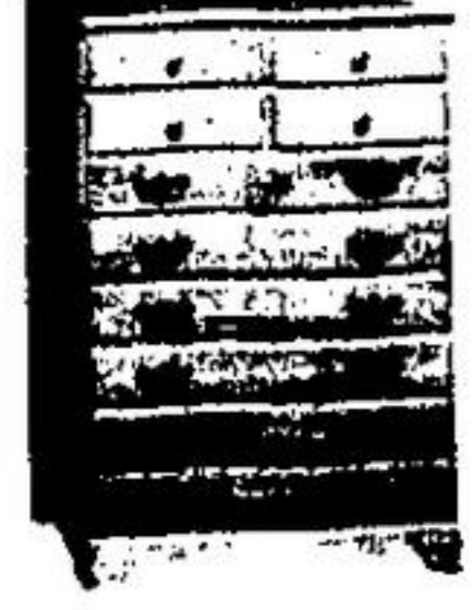
No. 17015 Five Drawer Chest 30" x 18" x 45" H 76" x 46 x 113 cm H