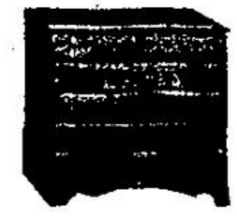
No. 17013 Three Drawer Chest 30" x 18" x 30" H 76 x 46 x 76 cm H