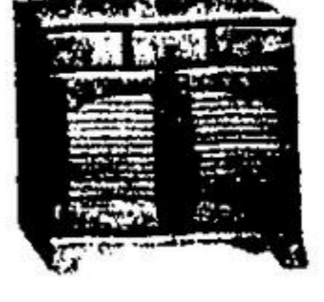
No. 17014 Louver Door Cabinet, One Drawer, Adjustable Shelf 30" x 18" x 30" H 76 x 46 x 76 cm H