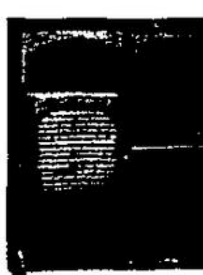
No. 17028 Hutch with Louver Door and Gallery 48" x 12" x 46" H 122 x 30 x 15 cm H