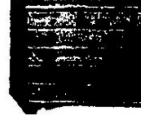
No. 17019 Four Drawer Chest with Louver Door 48" x 18" x 30" H 122 x 46 x 76 cm H