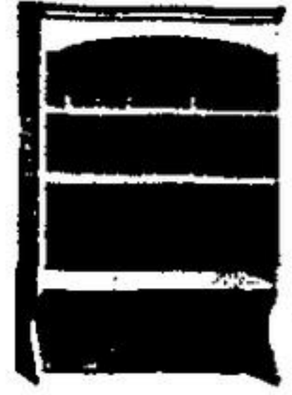
No. 17021 Open Hutch, Centre Adjustable Shelf, Brass Gallery 30" x 12" x 46" H 76 x 30 x 117 cm H