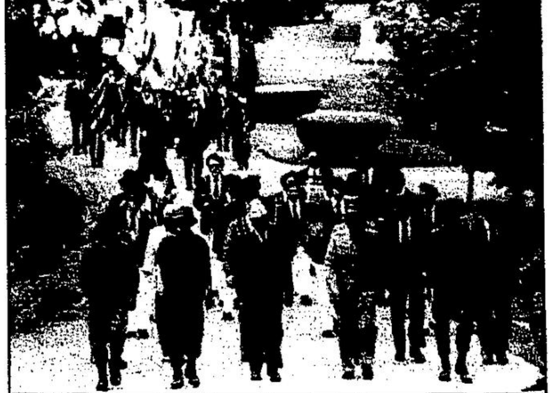
Plymouth, Mass., American Legion Post played host to members of the Royal Canadian Legion from Georgetown on U.S. Memorial Day, shown in background of this photo from Old Colony Memorial newspaper. The annual exchange will reverse roles this weekend when the American veterans arrive here Friday and Georgetown veterans play host. Both units will take part in the Warriors' Day parade at the Canadian National Exhibition on Saturday.