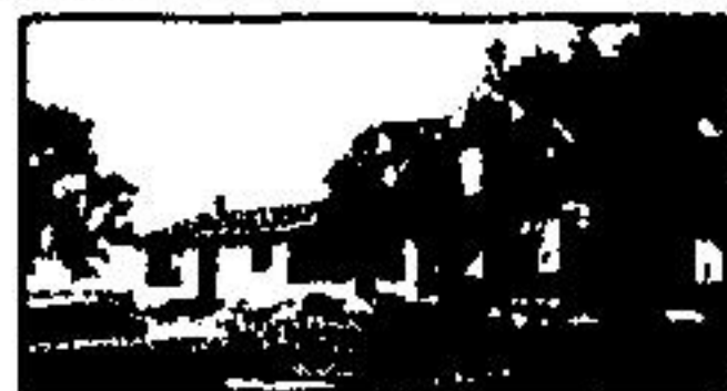
NEW BEAUTIFUL 2 FAMILY FARM

with 678' frontage. Vendor will hold mortgage with 50% down. 12% for 5 years. Please call Alex or Barb Glenn 877 5296 4591