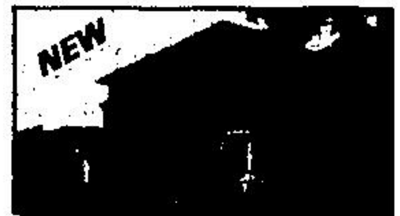
INCOME PROPERTY - TRIPLEX