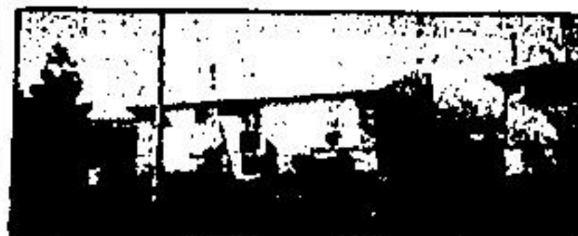
WANT A POOL - HILLSBURGH

PLANNING A MOVE? We offer personal service... professional approach... positive results.