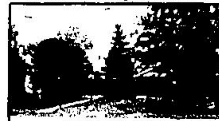
OPEN HOUSE THIS SAT. & SUN.