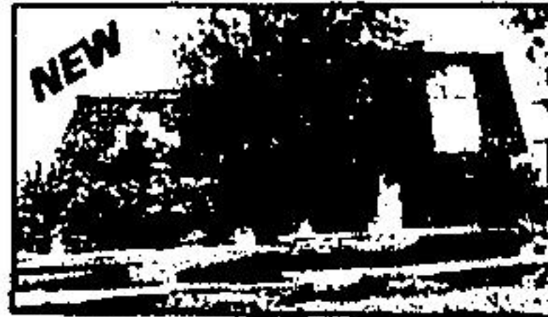
REAL COOL POOL - $78,500

Family room & fireplace, 1st mortgage at 12% till Feb. '86.