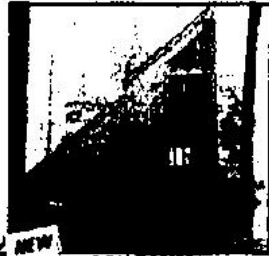
IT'S FANTASTIC CALEDON MOUNTAIN DRIVE

Older 4 bedroom home within walking distance of downtown. Original wood mouldings. Huge country kitchen. Separate dining room, fenced yard. $58,900. Call Sue Graham to view. 877 5296 4660