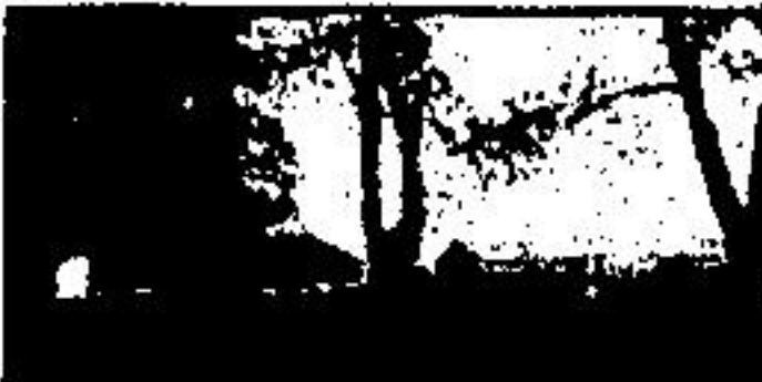
180 ACRE FARM

92 acres, some bush, 2 large ponds. East Credit River runs along south side. 5 bedroom brick home, 3 car garage, 60 x 36' steel barn. Vendor will hold mortgage below current rates. Howard Caton 877 5296 4653