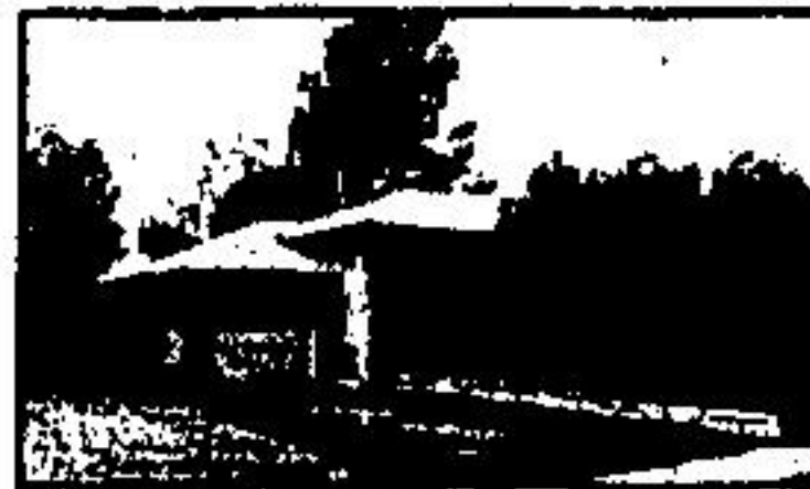
THE PRICE IS RIGHT - $78,900