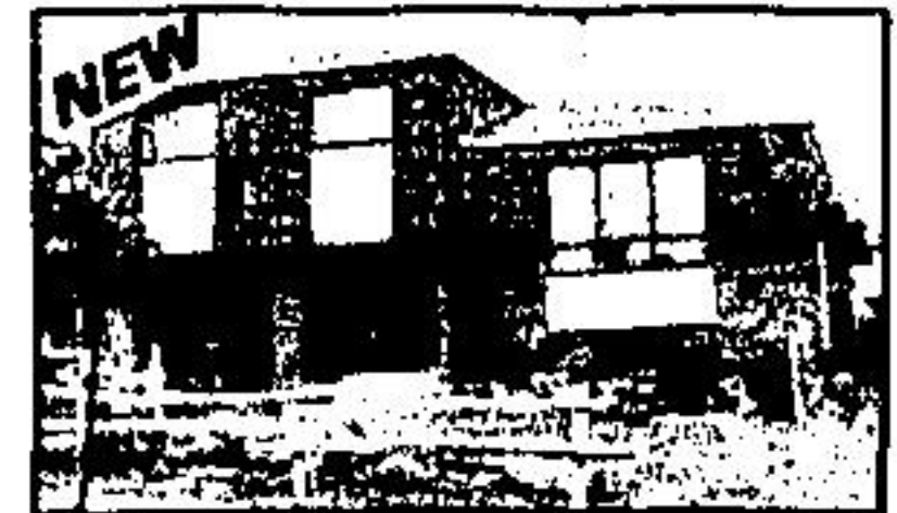
SUPER NEW LISTING

Family room & fireplace, 1st mortgage at 12% till Feb. '86.