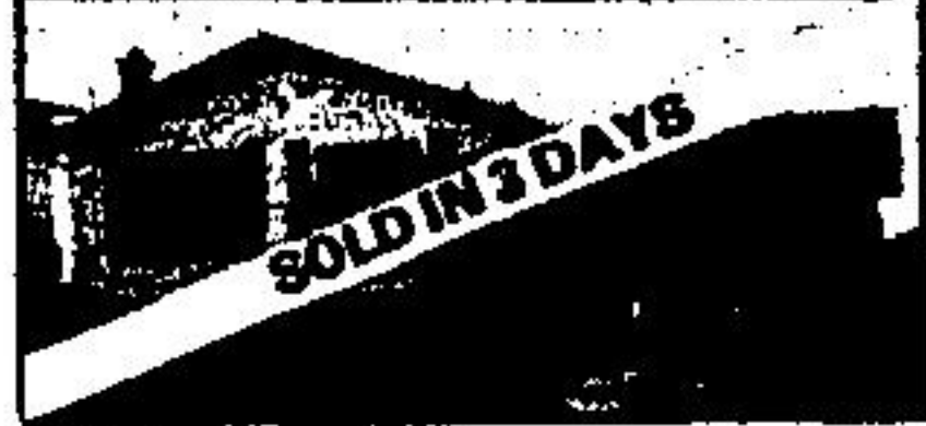
369 Delex Blvd., Georgetown Price $84,900 Ila Switzer 877-9500