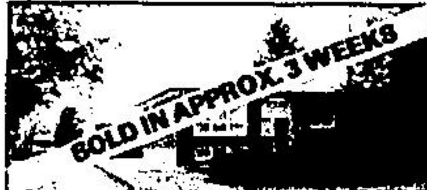
154 Tidey Ave., Acton Price $78,500