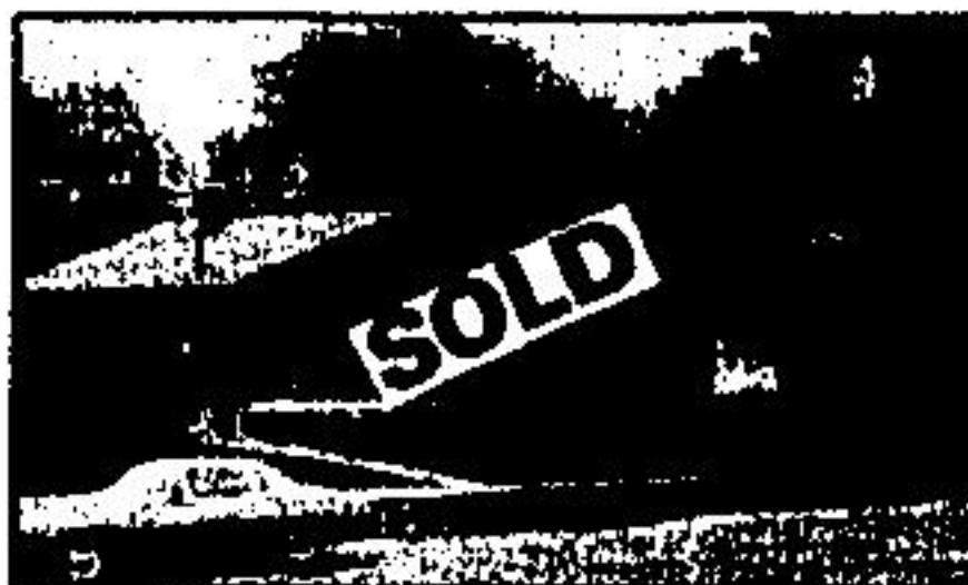
68 McIntyre Cres., Georgetown Price $82,500