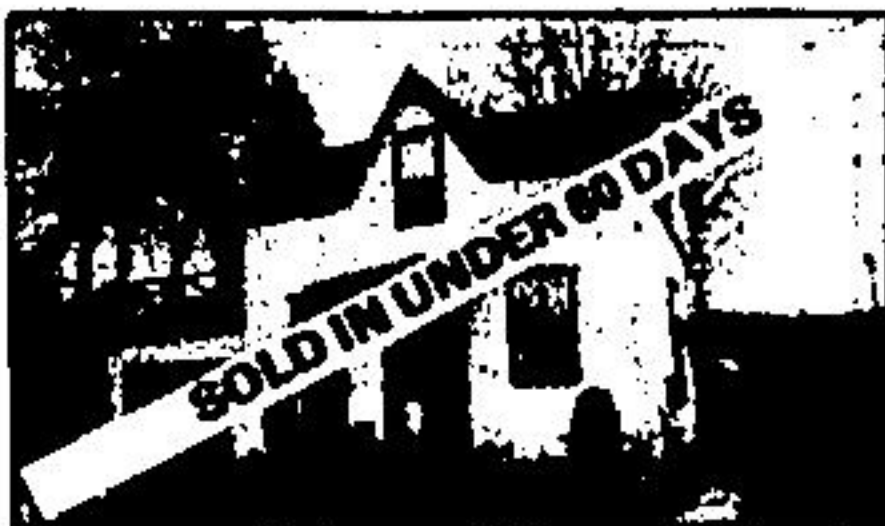
10 Knox Ave., Acton Price $59,000 Ed Wood 877-9500