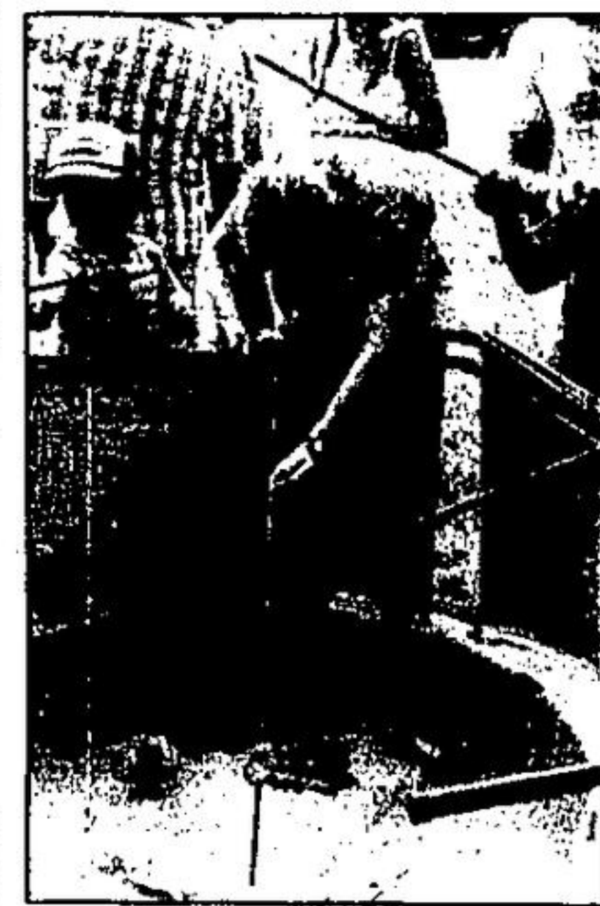
Fishing for prizes was among the many exciting games for kids to play at Ballinafad Canada Day celebration. Dads were able to enjoy a horseshoe tournament.