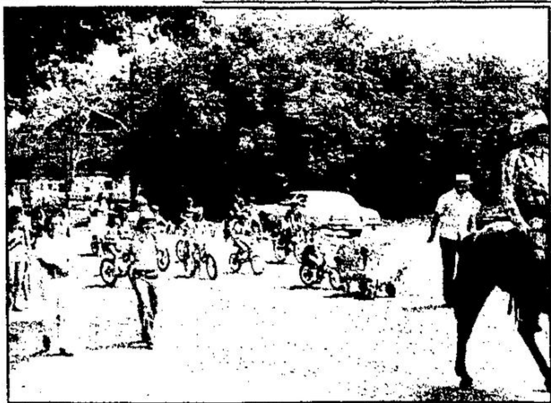
The traditional Canada Day parade in Ballinafad with decorated bicycles and wagons is always a highlight.