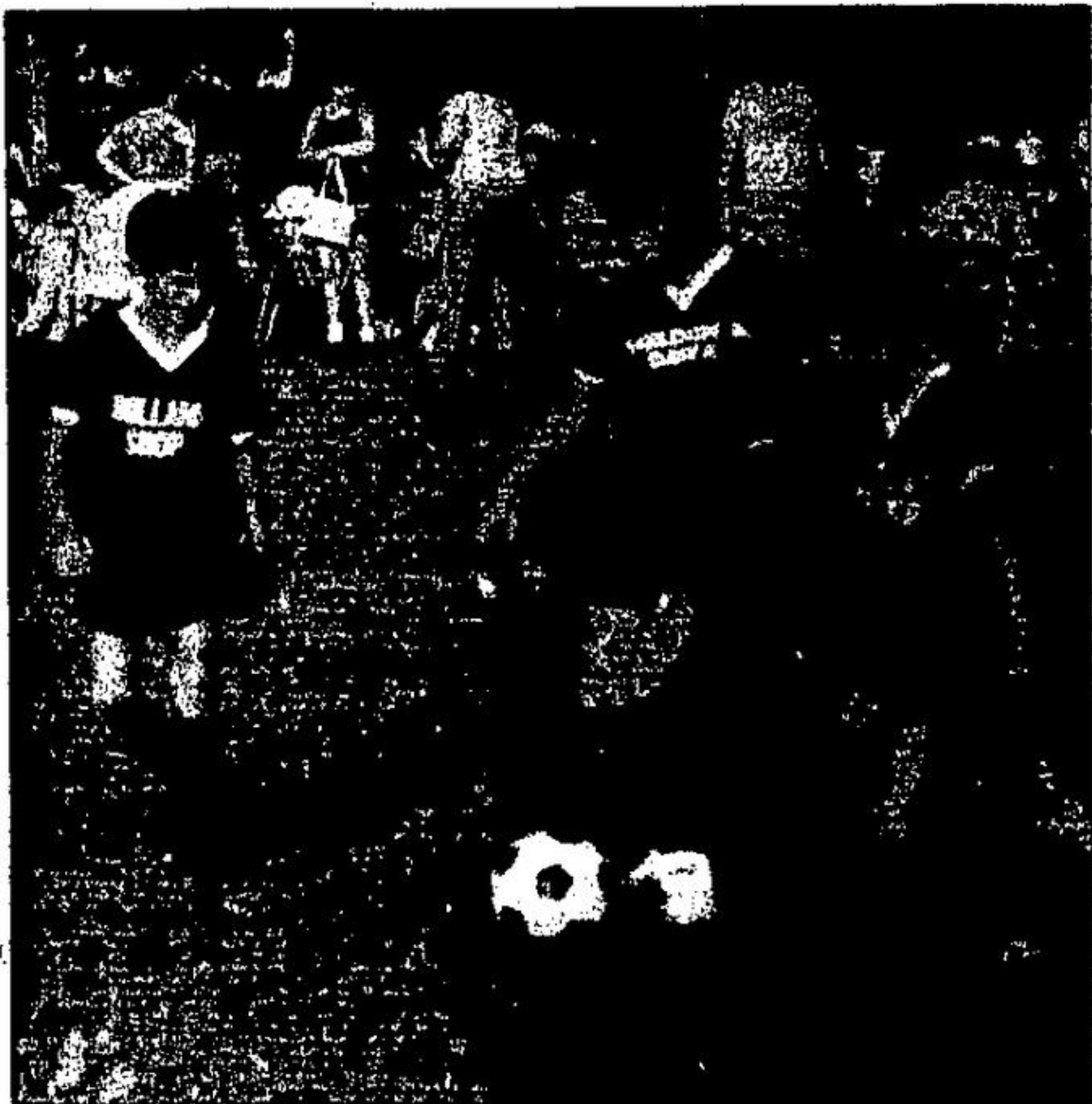
Holland Shop and Gordon Dave team members battled each other for possession of the ball in boys' soccer action on the M.Z. Bennett playing field Monday night. Both teams played well in an exciting match which saw Holland Shop come out on top.