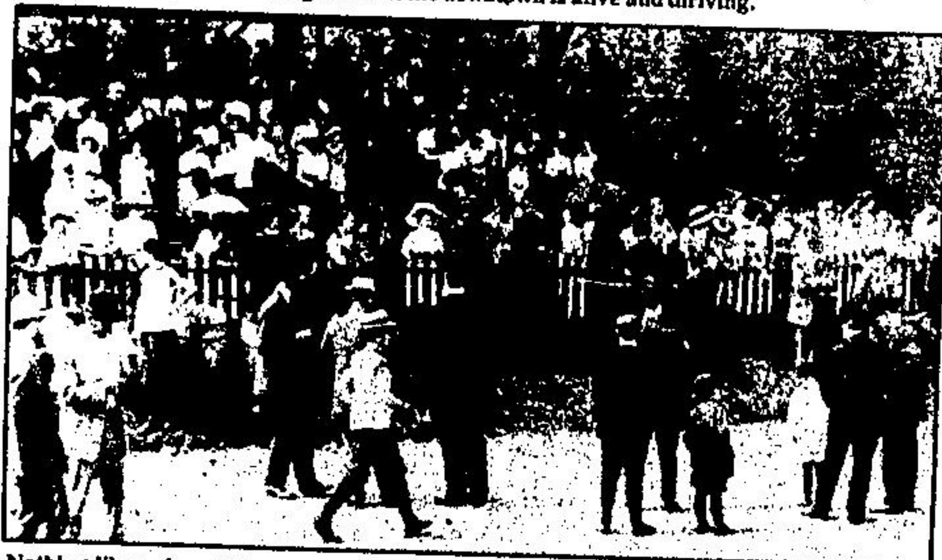
Nothing like a day at the park when grandma wore a long dress and bowlers were the rage.