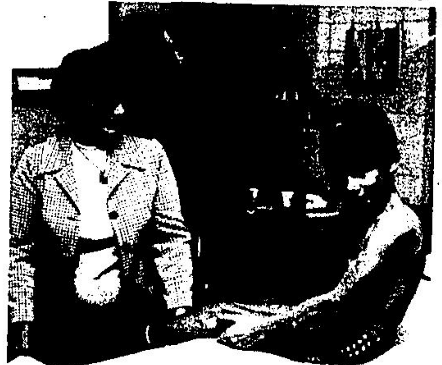
Diagnostic clinic held at Civic Hospital, North Bay, Ontario.

When disabled children can't come to us, we go to them. By conducting diagnostic clinics in northern areas of the province we give every child access to specialists in paediatrics, orthopaedics, neurology, plastic surgery, cardiology and physical medicine. Your Easter Seal dollars work hard... twelve months a year.